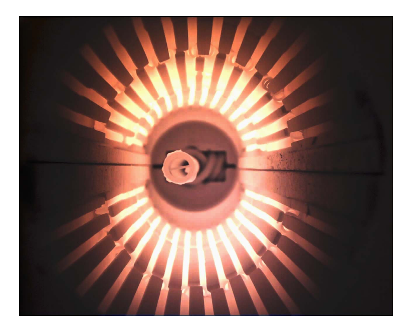
High Temperature Oven Testing of Solids Velocity Probe

While the probe and software algorithm have been designed for a defined range of conditions and solid particle diameters, the ability to measure velocity of different particles can be accomplished with minor adjustments to the probe and data acquisition system.