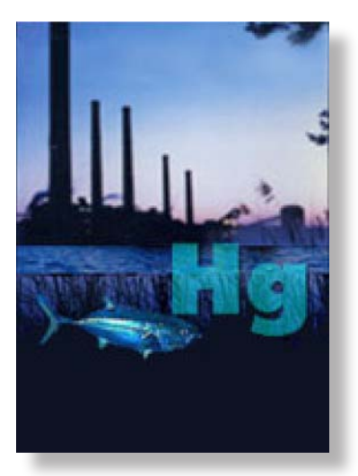
Figure 1. Mercury emitted from power plants may accumulate in the environment.

The coal-fired electric power generation sector is the biggest single anthropogenic (human-made) source of Hg emissions in North America. In turn, regulators have focused on setting Hg emission standards for the sector.