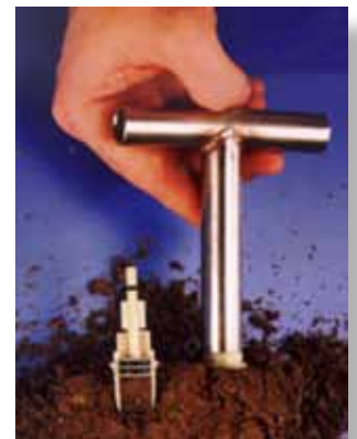
Above, an attachable, reusable En Core® T-handle is used to push the sampler into the soil.