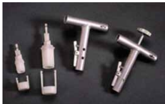
The En Core® Sampler, made of high-tech inert composite polymer, is available in 5 gram and 25 gram versions.

The En Core® Sampler has two reusable stainless steel attachments. These are a T-handle, which is used to push the sampler coring body/storage chamber into the soil for sample collection, and an extrusion tool, which attaches to the plunger for removing the sample from the storage chamber for analysis.