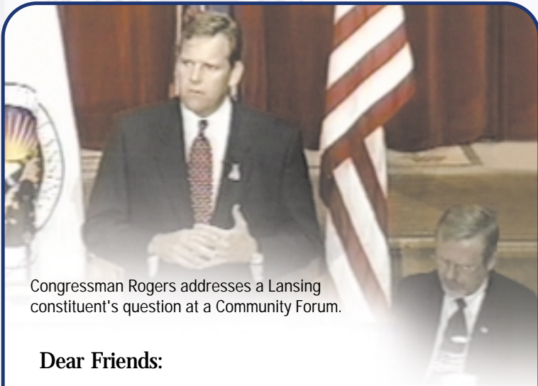
Congressman Rogers addresses a Lansing constituent's question at a Community Forum.