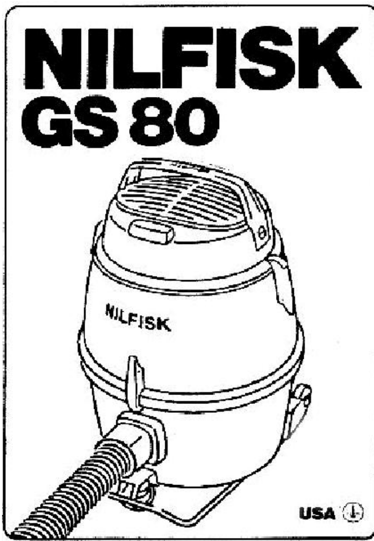
FIGURE 2. DIAGRAM OF NILFISK GS-80