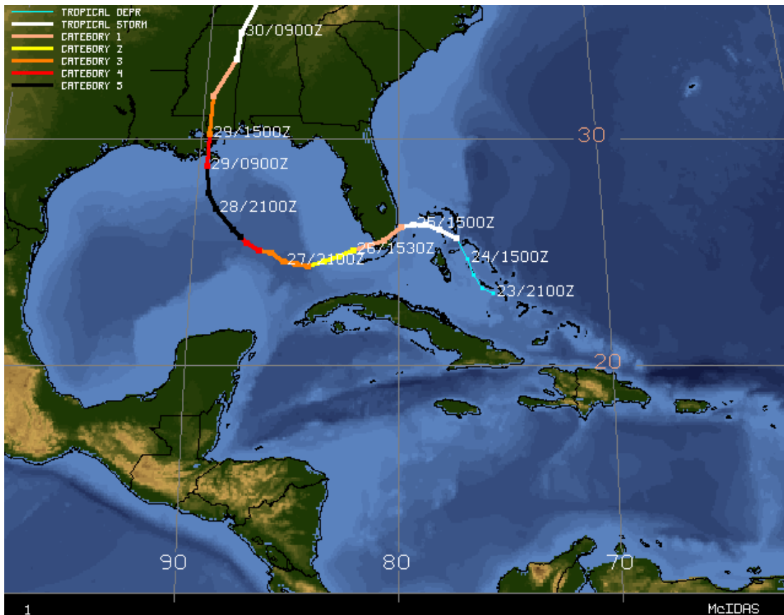
Figure 1: Hurricane Katrina Storm Track

Hurricane Katrina began as a tropical depression in the southeastern Bahamas on August 23, 2005. By the next day, the depression had developed into Tropical Storm Katrina. Moving slowly northwestward then westward through the Bahamas, Katrina strengthened over time. Just before landfall in South Florida on August 25, 2005, Tropical Storm Katrina developed into a Category 1 hurricane, with wind speeds of 74 miles per hour (mph) 1 (64 knots [kts]) or greater. Landfall occurred around 6:30 p.m. eastern daylight time (EDT) between Hallandale Beach and North Miami Beach, with wind speeds of approximately 80 mph (70 kts). Gusts of 90 mph (78 kts) were measured as Katrina came ashore. The storm moved southwesterly across the tip of the Florida peninsula with its winds decreasing slightly (see Figure 1). However, having spent only 7 hours on land, Katrina was not significantly diminished, and it regained intensity shortly after moving over the warm waters of the Gulf of Mexico.