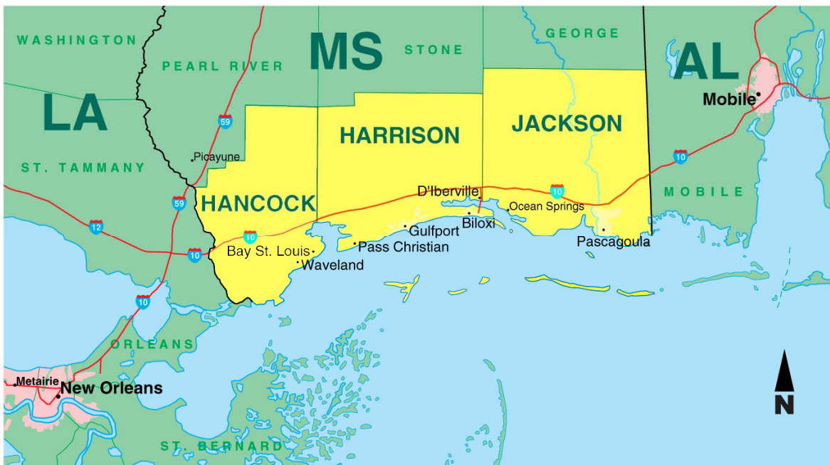
Figure 5: WWL Study Area within Mississippi

The entire Katrina WWL study area extended from southwest Alabama west through coastal Mississippi and southeastern Louisiana. This report focuses on the results of data collected in Mississippi to determine the WWL. In Mississippi the entire coastline was studied to identify areas where wind and water damages occurred and inland areas where damages were caused primarily by wind. Figure 5 shows the study area within Mississippi, with the coastal counties highlighted in yellow.