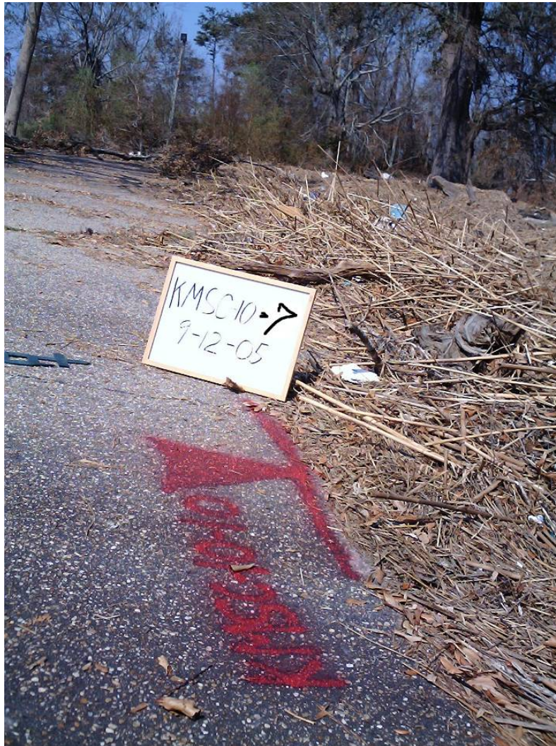
Figure 7: Example of a Debris Line

HWM points since a flood elevation could be determined at each of the WWL data points. Therefore, the WWL data points are actually a subset of the HWM data points. WWL data points are assigned a HWM identification number, which is also used as their WWL identifier. It is a three-part alphanumeric label. For example, a point might be labeled KMSC-05-16. The leading 'K' indicates that the HWM/WWL data point is a Hurricane Katrina data point, the middle 'MS' stands for Mississippi, and the last letter can be either a 'C' or an 'R' standing for coastal or riverine flooding. The middle two-digit number identifies the field crew that gathered the data, and the final two-digit number identifies the sequential data points collected by the field crew.