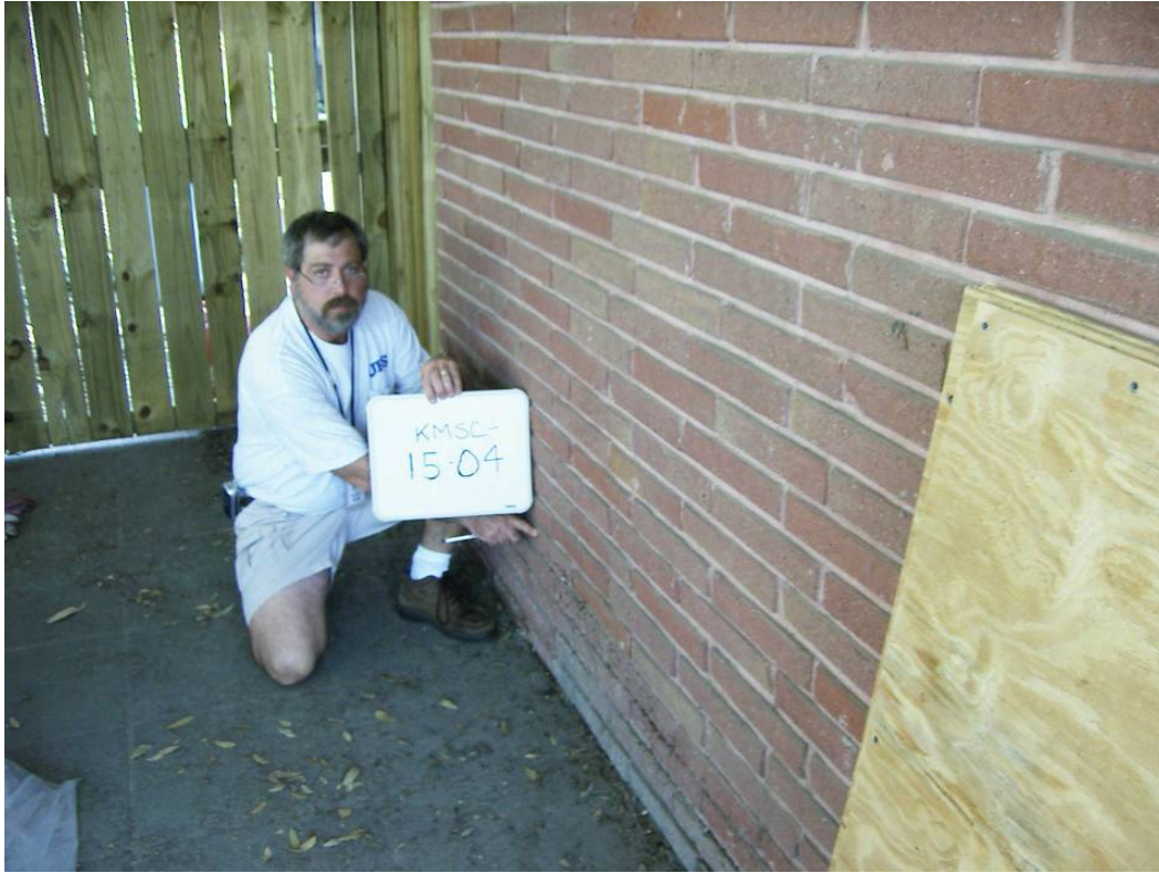
Figure 8: Example of a HWM

In some areas, both CHWMs and RHWMs were marked as WWL points. This was true along bayous and watercourses situated close to the coast. Although marked as RHWMs, some of these points were very close to the edge of coastal inundation. However, others were determined to be beyond the extent of coastal inundation. Only in four instances were such points used to help define the final WWL. Two of these points were located along Bayou La Salle and Bayou La Terre in Hancock County, and the other two points were located along Mary Walker Bayou and Sioux Bayou in Jackson County.