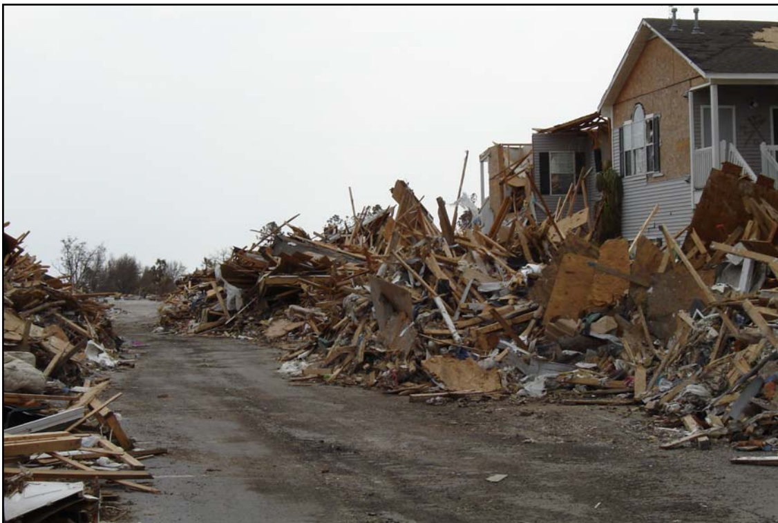
Figure 4: Mississippi Debris