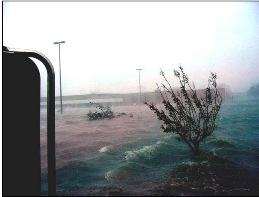
Figure 3: Mississippi Storm Surge