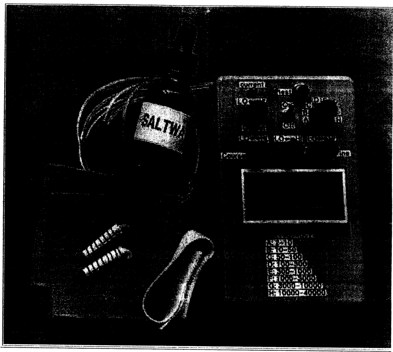
(Outdated photo. The latest version only has 4 frequency range positions which is simpler.)

be limited and you can move them around until the light comes on. It's really good to know that you are getting at least 150ua current so that you aren't wasting your time. Click here for blood electrification instructions.