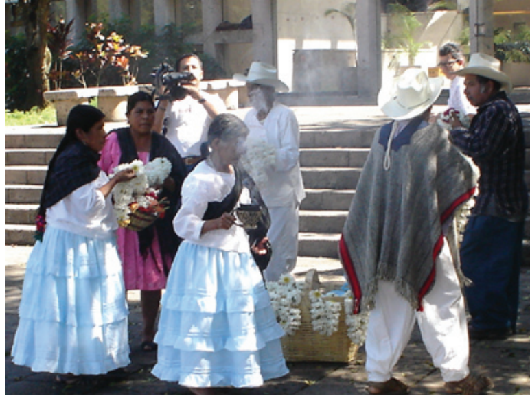
Indigenous leaders welcome U.S. Speaker Program guests with a traditional spiritual cleansing ceremony in Xalapa, Veracruz.

Indigenous communities in Mexico face many of the same challenges as Native communities in the United States. Limited local opportunities for wage labor exist due to marginalization and isolation. This has resulted in mass migration to urban centers within Mexico and immigration to other countries. Adverse environmental conditions such as soil erosion and inadequate water supply have crippled rural indigenous communities that have traditionally survived on subsistence farming. Failed land reform policies and lack of credit intensify these issues. Migration and government assimilation policies have resulted in the loss of traditional culture and language. Today, only 6% of Mexico's 12 million indigenous people still speak their traditional languages.