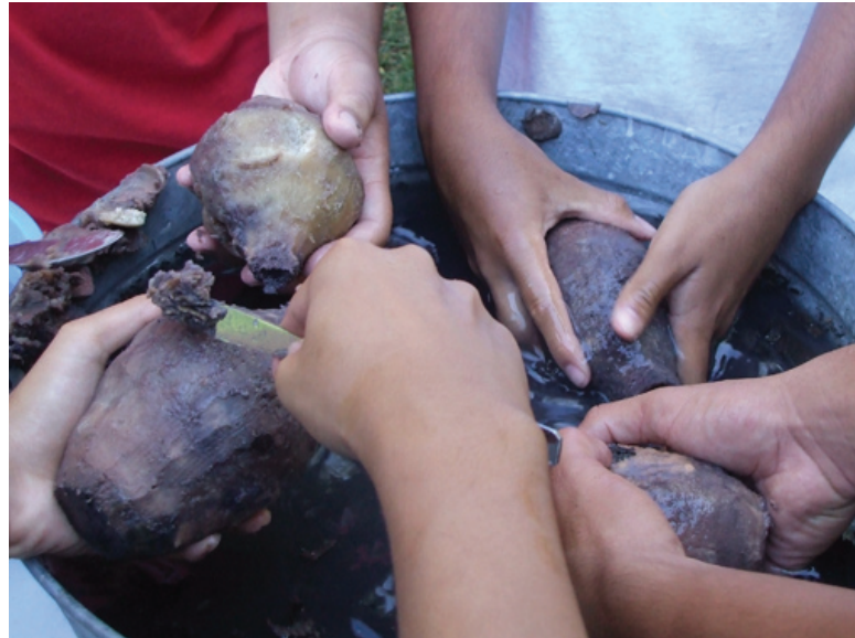
Youth in the Waianae Coast Comprehensive Health Center's ANA culinary program clean and prepare freshly cooked kalo root. In the Islands' eyes, the children of Hawaii hold the fate of the Hawaiian culture just as they hold the root of kalo.

Translation: No task is too big when done together. Explanation: United we stand, divided we fall. Hawaiian proverbs continue to be used in songs, dancing ( hula ), mythology and stories throughout Hawaii and the Pacific. Preservation of Native culture continues through oral history and culture.