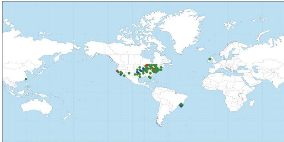
The map shows the locations of more than 50 computing and storage sites that form the Open Science Grid.

Porter, on the other hand, works on making sure the software released by