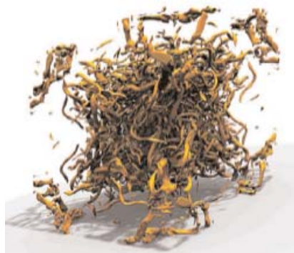
The streamlines in the image illustrate the velocity distribution of the particles as they move along the lattice links, demonstrating the effectiveness of the lattice-Boltzmann method to model fluid dynamics.