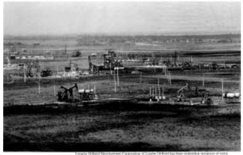
and super barry off depending on the program of st. A tack, and has realized a production reportly with annual suppl of addition task of useds of throughout three years.