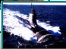
Naval Reactor Spent Nuclear Fuel