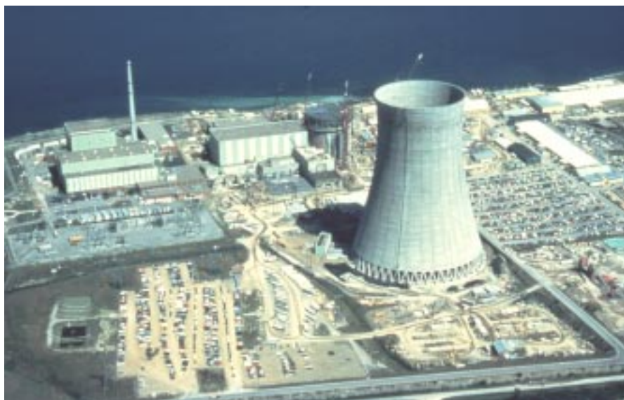
Commercial nuclear power plant

governed by the Standard Contract for Disposal of Spent Nuclear Fuel and/or High-Level Radioactive Waste , 10 CFR Part 961, promulgated as a Federal rule in 1983. Under the standard contract, the Department was to start accepting spent nuclear fuel from utilities in 1998. With no Federal facility available to receive the material, utilities are pursuing litigation to seek relief from hardships they allege as a consequence of the Department's inability to accept waste. The Department is working actively with the utilities to negotiate a settlement. Note 12 to OCRWM's Financial Statements (Appendix A) contains a discussion of the litigation and its current status.