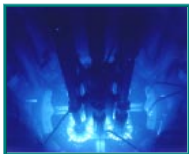
DOE and Foreign Research Reactor Spent Fuel