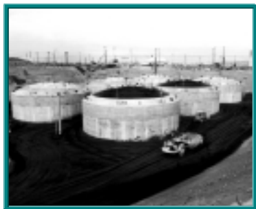
Defense Complex Clean-Up