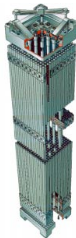
Commercial nuclear fuel assembly