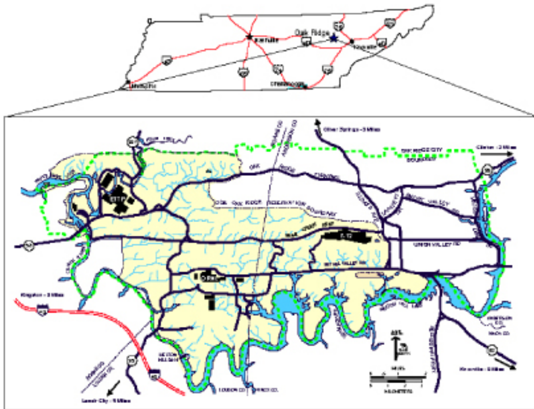
Figure 1. Map of the Oak Ridge Reservation showing East Tennessee Technology Park, Oak Ridge National Laboratory, and Y-12 National Security Complex.

The board is composed of up to 20 voting members, chosen to reflect the diversity of gender, race, profession, views, and interests of persons living near the ORR. Members are appointed by DOE and serve on a voluntary basis, without compensation. At the close of Fiscal Year (FY) 2008, the board consisted of members from five counties: Anderson, Blount,