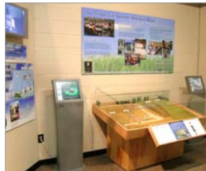
ORSSAB's museum exhibit of displays, posters, and kiosks was completely remodeled in FY 2008. Also featured is a poster, video presentation, and display about the board's Stewardship Education Resource Kit.

Two touch-screen kiosks take visitors on an interactive journey through the cleanup process at the Gunite Tanks, one of the highly successful remediation projects at ORNL. Suspended over the exhibit is one of the remotely controlled planes that used infrared photography to survey waste disposal sites