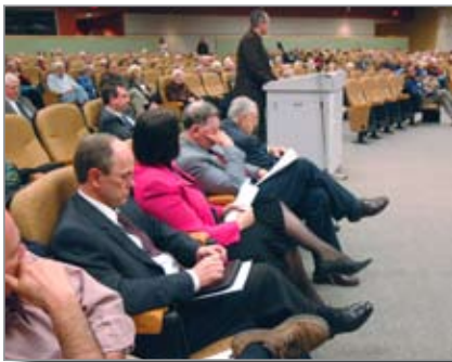
About 160 people attended the February meeting to express their opinions on how best to preserve the historical significance of the K-25 Building at ETPP.

members submitted a minority recommendation that the building be razed and other avenues be considered to memorialize the building. In an attempt to prevent the loss of other buildings within the EM scope with historic significance because of neglect, the board submitted a follow-up recommendation on the subject at its July meeting.