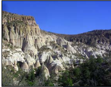
Tent Rocks, Jemez Mountains