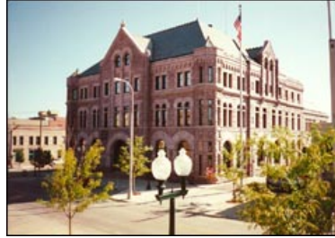
US District Courthouse, Sioux Falls, SD

From top left