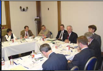
Southern Regional NEPA Roundtable discussion on the NEPA Task Force report entitled, Modernizing NEPA Implementation