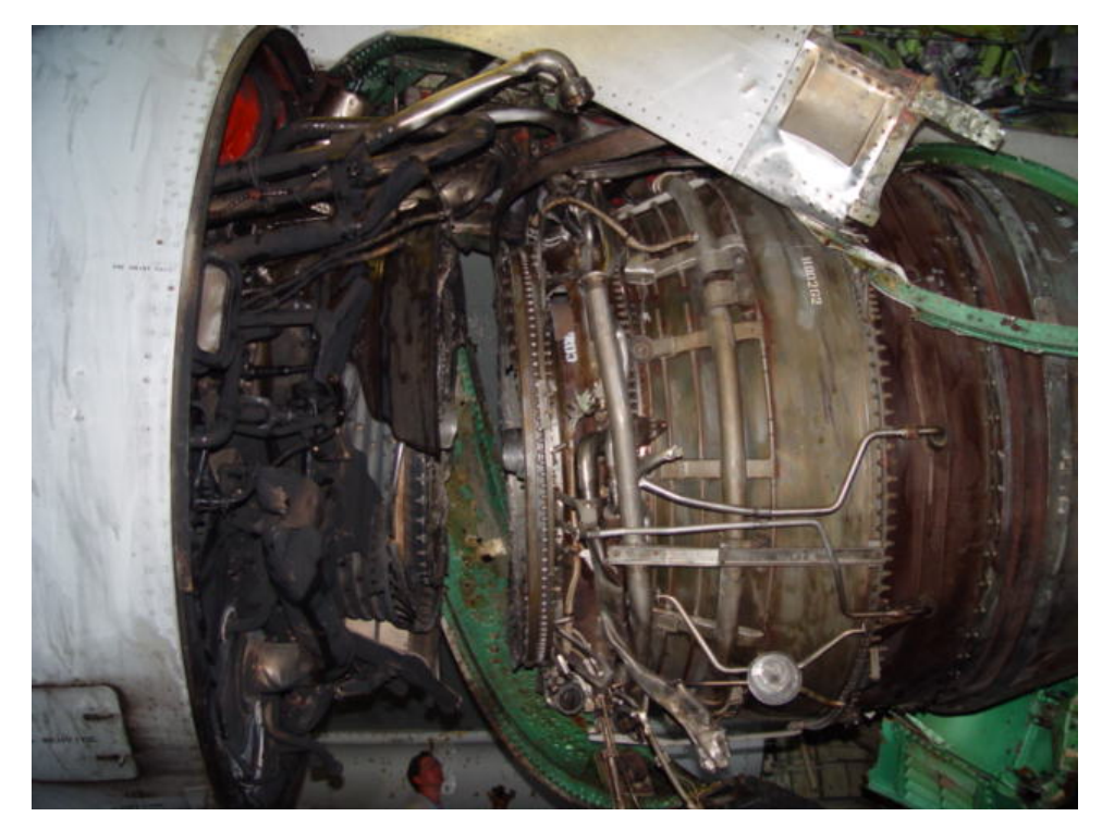
Figure 2. View of the left side of the No. 1 engine showing the engine split in two.

Examination of the No. 2 engine revealed that the left side of the engine's nacelle was peppered with holes and impact marks from debris from the No. 1 engine in addition to the piece of the HPT stage 1 disk that had gone through the exhaust duct and was protruding from the right side of the engine (see figure 3). The examination of the airplane revealed numerous holes in the left and right wing's fuel tanks where fuel leaked out, feeding the ground fire that burned the left wing and the fuselage aft of the wing.<sup>6</sup>