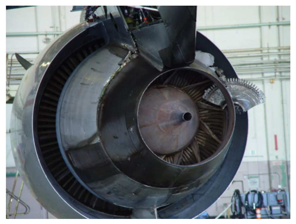
Figure 3. View of the exhaust of No. 2 engine showing piece of HPT stage 1 disk protruding from the right side of the engine exhaust duct.

slot bottoms each contained a crack that coincided with a small dent.<sup>9</sup> Although small, randomly located areas of classical fatigue striations were observed, intergranular fatigue fractures (which made up the bulk of the area of the progressive fracture on the ruptured disk) do not have striations; thus, it was not possible to determine how fast the fatigue fracture had been propagating before the disk ruptured. The aft face of the disk and blade slot bottom surface were dimpled, which is indicative of these surfaces having been shotpeened.<sup>10</sup>