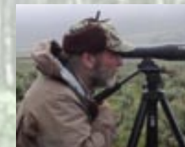
USDA Forest Service