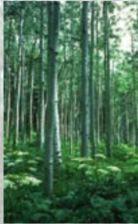
USDA Forest Service

Pacific Northwest Region 333 SW First Ave. Portland, OR 97204-3440 503-808-2972