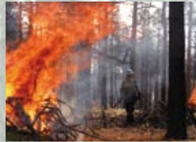
USDA Forest Service