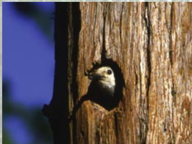
USDA Forest Service