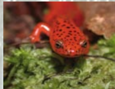
Sara Faust, USGS