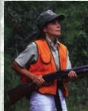
USDA Forest Service