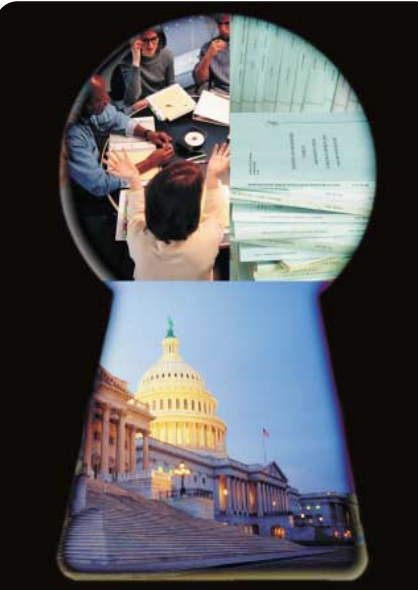
Data into action. Accurate exposure data are crucial for assessing risk from environmental contaminants and developing responsive regulatory and legislative solutions.

The findings came as no surprise to environmental health practitioners and officials, who have been working to coordinate interagency efforts for years. In the mid-1990s, the National Science and Technology Council's Committee on Environment and Natural Resources made integrating and coordinating environmental monitoring and research networks and programs across federal government a priority. The committee recognized that many such programs had single-agency or single-resource focuses, and that chief among such programs were exposure assessment initiatives. Last fall, the Committee on Environment and Natural Resources advocated creating an