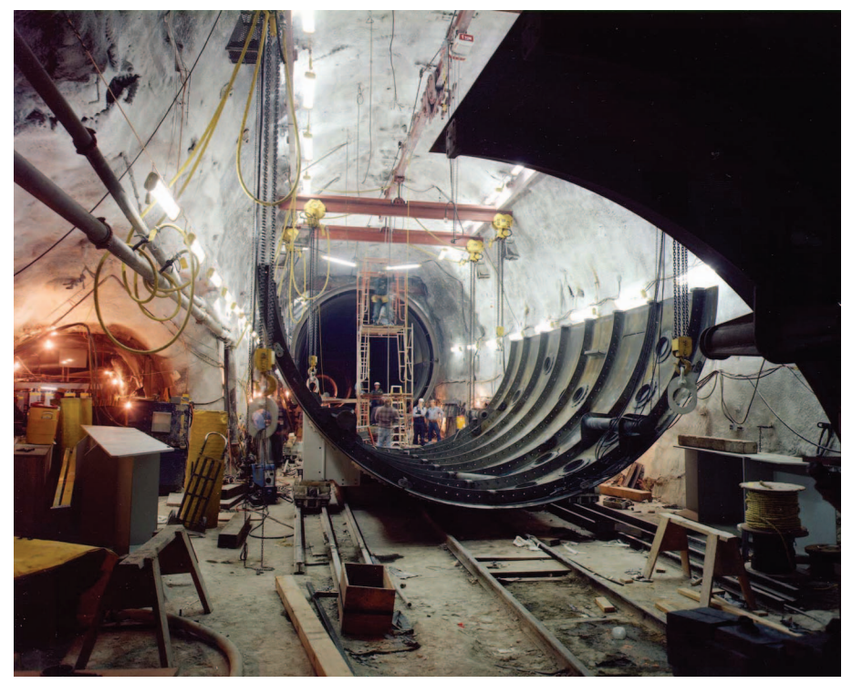
Figure 2. Nevada Test Site. Photograph reproduced from DOE Nevada (2003).

Crystalline silica particles are ingested by alveolar macrophages and result in inflammation and activation of fibroblasts (Parks et al. 1999). The digested crystalline silica destroys the macrophages, and the crystalline silica is again digested by new macrophages. This repeated process leads to chronic immune activity and fibrosis. Studies have shown that crystalline silica can be mobilized from the lungs to other organs, including lymph nodes, spleen, and kidney (Parks et al. 1999). Silicosis and mineral dust pneumoconiosis have been linked to an increase in autoantibodies, immune complexes, and excess production of immunoglobulins, even in the absence of a specific autoimmune disease (Jones et al. 1976; Lippmann et al. 1973). Many of the cases of autoimmune disease were first discovered during screening of silica-exposed workers or workers who were being treated for silicosis. It was not clear in these cases whether the silicosis was a pathologic process that may predispose some individuals to develop autoimmune disease or whether the opposite was true, that the autoimmune disease may