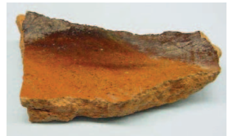
Figure 1. Broken piece of lead-glazed pottery found in yard.