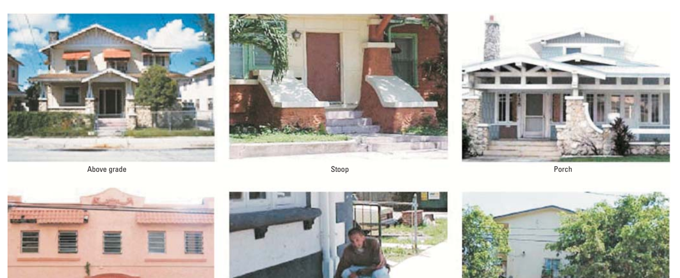
Ample window area

Analytic strategy. The present analyses examined the sequential relationships among each of the following: a ) built-environment features measured at prebaseline (i.e., 2000–2002), b ) social support measured at baseline (i.e., beginning in 2002), c ) psychological distress measured at 12 months, and d ) physical functioning measured at 24 months. Thus, the four