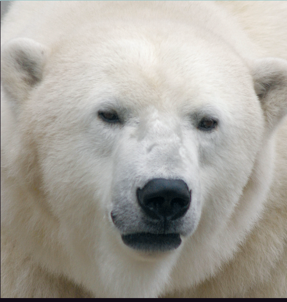
Watching wildlife. Research has documented reproductive and developmental abnormalities linked to EDC exposures in wildlife species such as alligators and polar bears, although what these results mean for humans is still unknown.