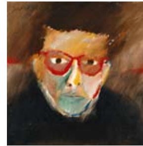
Fritz Scholder, Self Portrait at 28 , 1965. Oil on canvas, 40.6 x 40.6 cm. Collection of the Estate of Fritz Scholder.