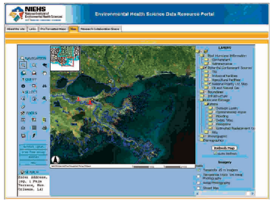
Figure 4. NIEHS Portal GIS.

In the first model, the portal team is expected to a) create a separate space on the portal for the selected project; b) sculpt the particular project's user interface to include only the portal's most useful existing data