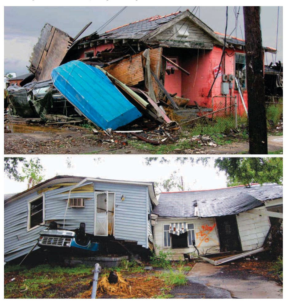
Figure 2. Houses destroyed in Lower Ninth Ward of New Orleans, April 2006.

The NIEHS Portal responds to environmental health issues and concerns facing communities of the Gulf Coast region while providing the cyberinfrastructure necessary to advance integrative research and facilitate community-linked research. In this regard, one important measure of performance for