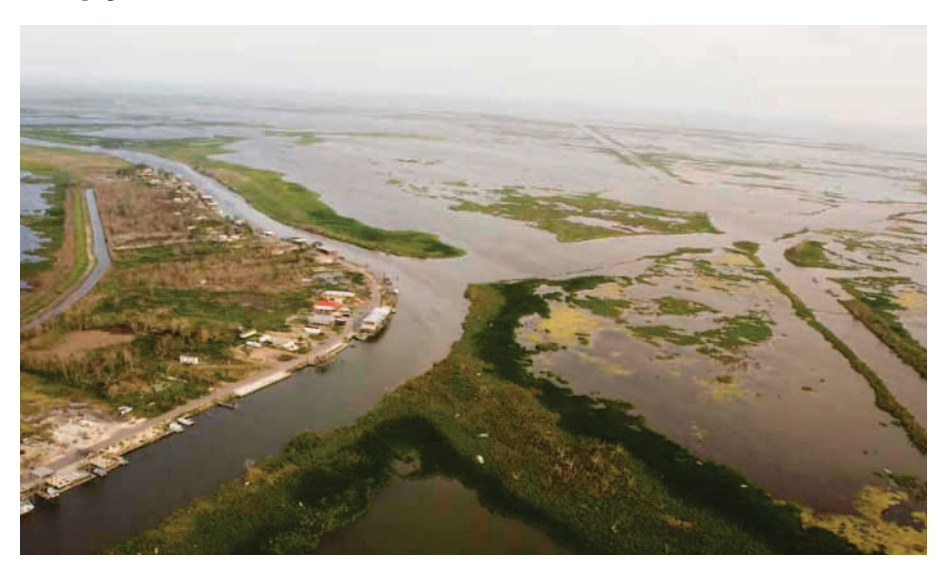
Figure 1. Wetland destruction caused by Hurricane Katrina near New Orleans, April 2006.

New modes of knowledge production and networking. In recent years, information and communications technology experts, in