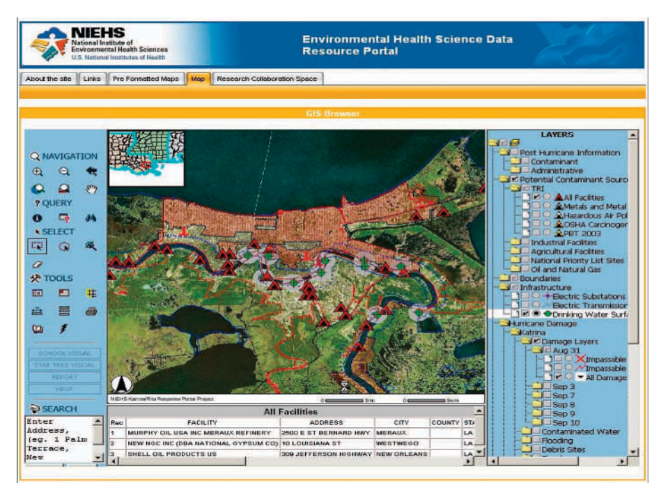
Figure 5. NIEHS Portal GIS showing workspace in which a user selected TRI facilities within 1 mile of drinking water surface intakes.

layers (i.e., avoid clutter by eliminating layers deemed nonessential); c) do some original data preparation/packaging to meet the needs of the particular project; and d) provide tools for secure data archiving, sharing, integration, visualization, and analysis. In this model, the portal team becomes (among other things) a service provider helping users meet particular needs (e.g., the need to select a study site).