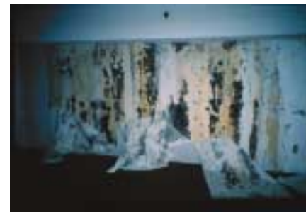
Figure 1. Water damage and fungal growth in a room with wallpaper stripped from walls.

Laboratory evaluation. Because there are currently no useful biological monitoring techniques to assess exposure to mycotoxins, we conducted a pilot serologic evaluation using a test under development to identify specific IgG and IgM antibodies to roridin (a trichothecene mycotoxin known to be produced by several different fungi including Stachybotrys species). Trichothecene mycotoxins are potent irritants and may act as haptens, which bind constitutive proteins exerting an immune response similar to what has been described for other xenobiotics. De