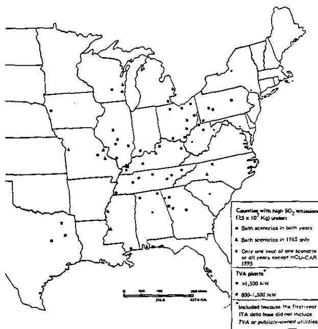
FIGURE 1. Comparison of \text{SO}_2 "hot spot" counties under scenarios REF-CAR and HCU-CAR in 1985 and 1995 from the impact assessment model. Counties with high \text{SO}_2 emissions ( \geq 5 \times 10^7 kg) under: (■) both scenarios in both years; (▲) both scenarios in 1985 only, (★) only one year of one scenario or all years except HCU-CAR 1995; TVA plants (●) > 1500 MW and (○) 800-1500 MW (included because the first-year ITA data base did not include TVA or publicly owned utilities)

(1) the highest density of "hot spots" under both scenarios and both years is in the Upper Ohio River Basin; (2) ten "hot spots" which disappear after 1985 under both scenarios are generally scattered around the eastern U.S. except for the St. Louis area, where two such "hot spots" are