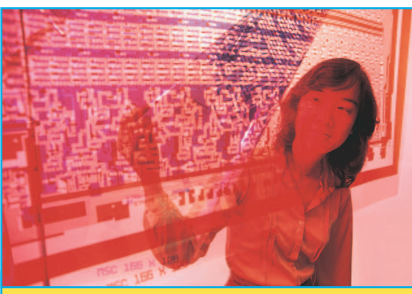
Old world, new growth. Chip manufacturing is rapidly concentrating in Asia due to factors such as large market potential, lower import taxes, skilled workers—and possibly less strict environmental health regulations.

Taiwanese studies also indicate that past industry practices are harming ĥuman health. Ĵung-Der Wang, a professor at the Institute of Occupational Medicine and Industrial Hygiene of National Taiwan University Hospital, studied the site of a semiconductor factory that operated from roughly 1970 to 1992. Even after groundwater remediation, a variety of volatile organic compounds (VOCs), including vinyl chloride, tetrachloroethylene, and trichloroethylene, were still present in groundwater. In the 8 February 2002 issue of Journal of Toxicology and Environmental Health Part A, Wang reported on a health risk assessment that used U.S. Environmental Protection Agency methods to show that residents, during showers and while washing, were inhaling and dermally absorbing unsafe amounts of VOCs (residents were already boiling their drinking water to disperse VOCs, so ingestion was not a part of the study). In a separate study published in the same issue of the same journal,