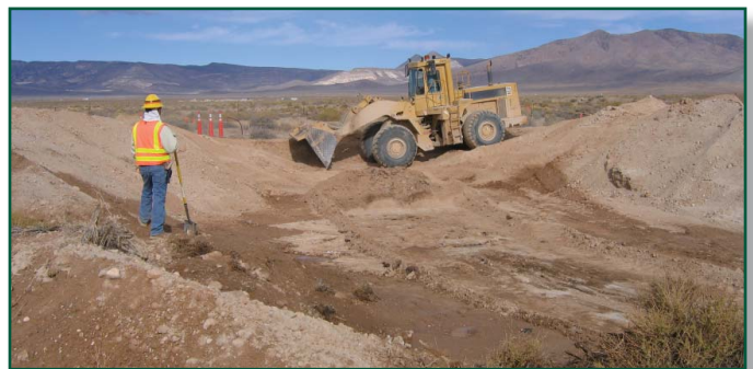
Contaminated soil in Area 6 of the Nevada Test Site is remediated in accordance with the Federal Facility Agreement and Consent Order.

There are other public involvement activities associated with the DOE Environmental Management Program. Interested stakeholders can receive updates on proposed and current activities by signing up for the Environmental Management electronic mailing list at envmgt@nv.doe.gov . Community Advisory Board meetings provide opportunities for the public to play an active role in the decision-making process, and speakers can be requested for presentations to community organizations.