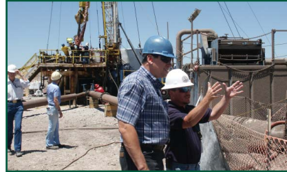
Nevada Test Site Community Advisory Board members tour an Underground Test Area well drilling site in Area 16 of the Nevada Test Site.

cost-effective corrective actions in the state. It also establishes a framework for identifying, prioritizing, investigating, remediating, and monitoring contaminated sites.