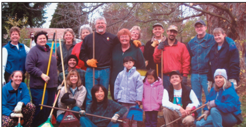
NIFC Top Dogs made a big difference for a local senior citizen.