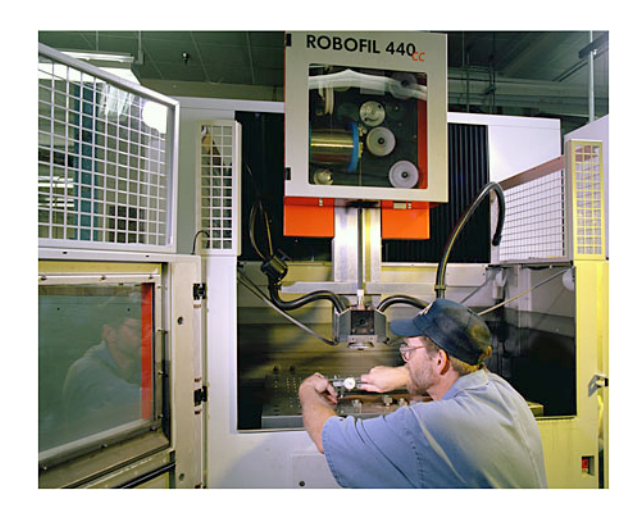
Wire-feed EDM cuts complex features and contours fast and with precision

Multi-purpose machining centers improve safety, productivity, quality, and responsiveness