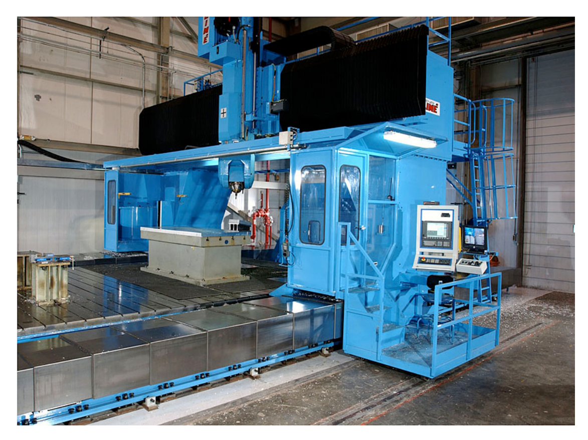
High-Speed Henri Liné 5-Axis Gantry Mill