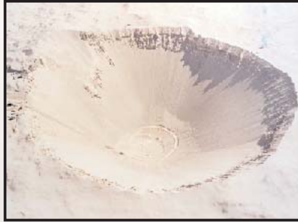
Sedan crater is a result of a Plowshare Program test to study excavation techniques using nuclear weapons.

By 1974 approximately $82 million had been invested in the nuclear gas stimulation program. It was estimated that after 25 years of gas production of all the natural gas deemed recoverable, only 15 to 40 percent of the investment could be recovered. Consequently, under the pressure of economic and environmental concerns, the Plowshare Program was discontinued at the end of Fiscal Year 1975.