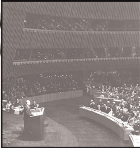
President Dwight D. Eisenhower makes his “Atoms for Peace” speech to the General Assembly of the United Nations on December 8, 1953.

On June 6, 1958, the United States Atomic Energy Commission, now the U.S. Department of Energy (DOE), announced the Plowshare Program, named for the biblical injunction to ensure peace by “beating swords into plowshares.”