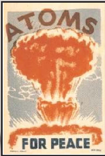
The Plowshare Program embodied President Eisenhower’s Atoms for Peace initiative, devised in 1953.

The program was designed as a research and development activity to explore the technical and economic feasibility of using nuclear explosives for industrial applications. President Dwight D. Eisenhower introduced the concept in his “Atoms for Peace” speech before the United Nations on December 8, 1953. Eisenhower attempted to transform the atom from a perceived tool of destruction into a benefit for mankind. The relatively inexpensive energy available from nuclear explosions could prove useful for a wide variety of peaceful purposes, such as: canals, harbors, highway and railroad cuts through mountains, open pit mining, dam construction, and other quarry and construction related projects. Underground nuclear explosions included stimulation of natural gas production, and formation of underground natural gas and petroleum storage reservoirs.