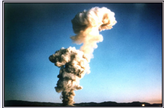
Recognizing characteristics of a smoke cloud from a nuclear detonation

For More Information, Contact the Registration Desk at: National Nuclear Security Administration/Nevada Site Office Counter Terrorism Operations Support Program P.O. Box 98521, M/S NLV126, Las Vegas, NV 89193-8521 702.295.3224 • 702.537.2639 Fax E-mail: ctosreg@nv.doe.gov www.nv.doe.gov/combatingterrorism