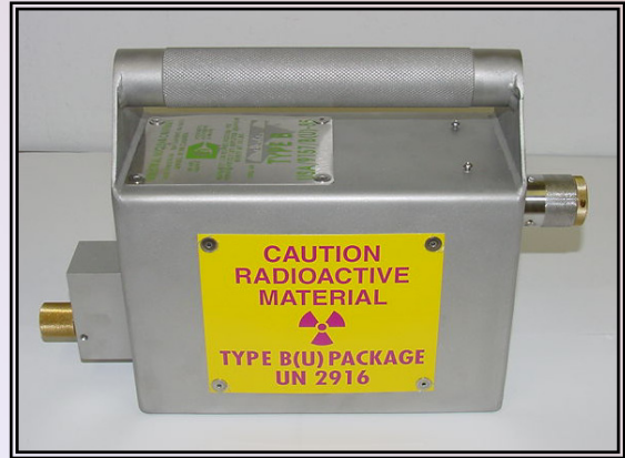
Typical radiography camera that could be stolen for illicit use