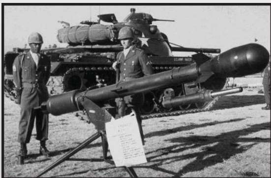
The Davy Crockett weapons system is mounted on a vehicle and prepared for launch.

The desert temperature hovered at 90 degrees Fahrenheit the morning of July 17, 1962 at the Nevada Test Site (NTS). Eventually the beating sun would increase the heat to over 105 degrees later that day, but at 10:00 a.m., a crowd of 396 spectators braved the scorching temperature and relentless sun to witness the last atmospheric test ever conducted by the United States. The crowd gathered in Area 18 of the NTS, approximately two miles from ground zero, where a Davy Crockett weapon system would soon launch the Little Feller I shot.