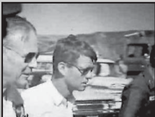
Chairman of the Joint Chiefs of Staff General Maxwell Taylor (left), and the U.S. Attorney General Robert F. Kennedy (center) were on hand to witness the historic event.

Little Feller I was planned and executed in just 70 days. Originally, three Little Feller shots were considered. The first shot was set for detonation just three feet above ground. The second and third shots were set to detonate at a height of 40 feet. As planning proceeded, shot three was cancelled and shot two became Little Feller I. It was set to detonate three feet above the ground and employ a military tactical maneuver.