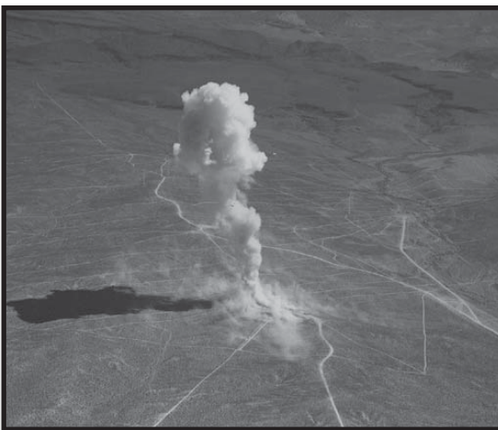
The top of the cloud formed by Little Feller I reached 11,000 feet and moved north-northwest from the point of detonation.

Five personnel from the maneuver task force launched the weapon from the Davy Crockett launcher mounted on an armored personnel carrier. Little Feller I detonated three feet above the surface on target, 2,796 feet from the firing position. After the initial radiation surveys were completed, the troops entered their vehicles and moved into the shot area, where they spent almost one hour conducting maneuvers.