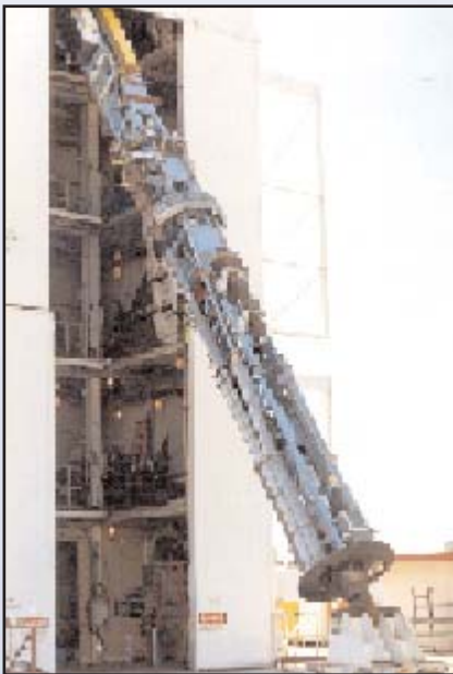
The diagnostic canister moves into the emplacement tower for underground placement.