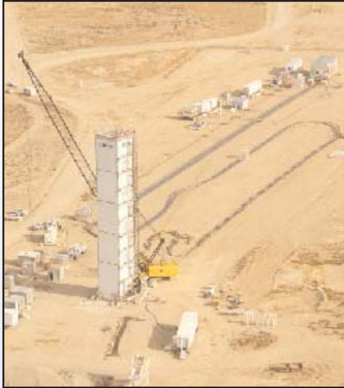
An aerial view of the emplacement tower, diagnostic cables and diagnostic trailers used during an underground nuclear test.

Between 1951 and 1992, 828 underground nuclear tests were conducted in specially drilled shafts, horizontal tunnels, and craters at the Nevada Test Site. Most vertical shaft tests assisted in the development of new weapon systems. Horizontal tunnel tests occurred to evaluate the effects (radiation, ground shock) of various weapons on military hardware and systems.