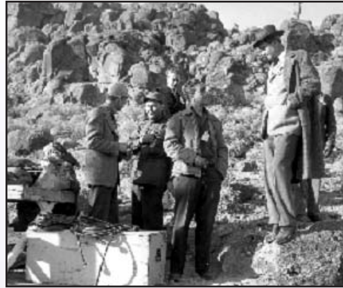
News Nob, a stop on the Nevada Test Site tour, was a gathering place for members of the press to witness atmospheric tests.

News Nob is the viewpoint from which journalists such as Walter Cronkite and visiting dignitaries witnessed atmospheric tests.