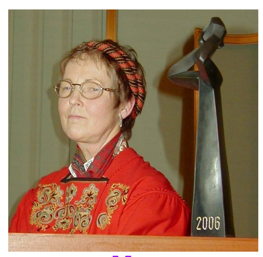
Mercury Policy Project

Awarded to persons who "Openly and courageously have revealed or opposed conditions in Norway that threaten basic values in Norwegian society: human rights, democracy and legal protection."