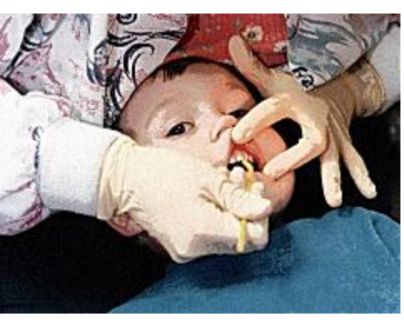
Mercury Policy Project