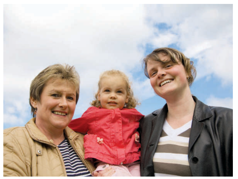
Window to the future. The Breast Cancer and the Environment Research Centers are looking at ways that early environmental exposures may influence later breast cancer risk.

One example of the kind of multidisciplinary data that can be generated by this collaboration can be found in a paper presented at the meeting, which was later published in the January 2007 issue of EHP. Center researchers collaborated with the CDC to analyze urine samples collected from 6- to 8-year-old girls to assess the levels of biomarkers of exposure to a number of phytoestrogens, phthalates, and phenols. Many of