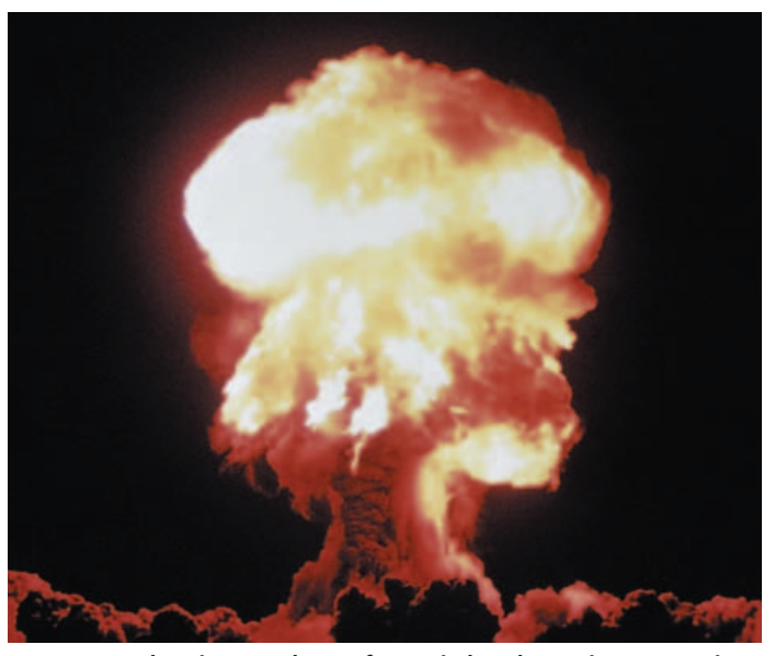
New research using a cohort of atomic bomb survivors questions how assessments of cancer risk from radiation exposure are made.