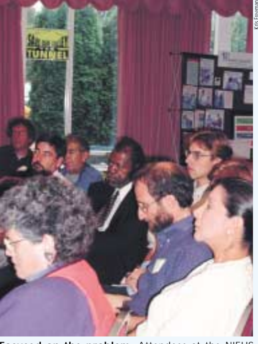
Focused on the problem. Attendees at the NIEHS town meeting in Seattle consider information and opinions on the disparate effects of environmental pollutants on different populations.