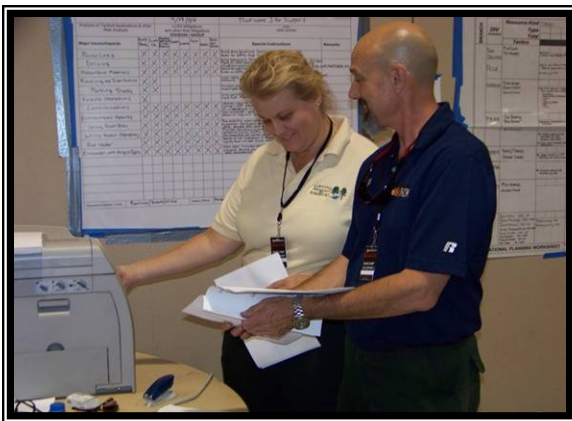
A NIMO member coaching the Virginia Dept. of Forestry

NIMO is tasked with increasing capacity and capability of resources by coaching and mentoring traditional and non-traditional partners, incident management teams and agencies personnel in incident management; including guidance in developing new decision tools, providing learn-as-you-go opportunities, building Type 2 & 3 organizations, assisting with complexity analysis, teaching concepts of appropriate management response, coaching for functional skills, researching grant opportunities for training, logistical expertise and demonstrating "non-fire" skills such as staging area/mobilization center operations.