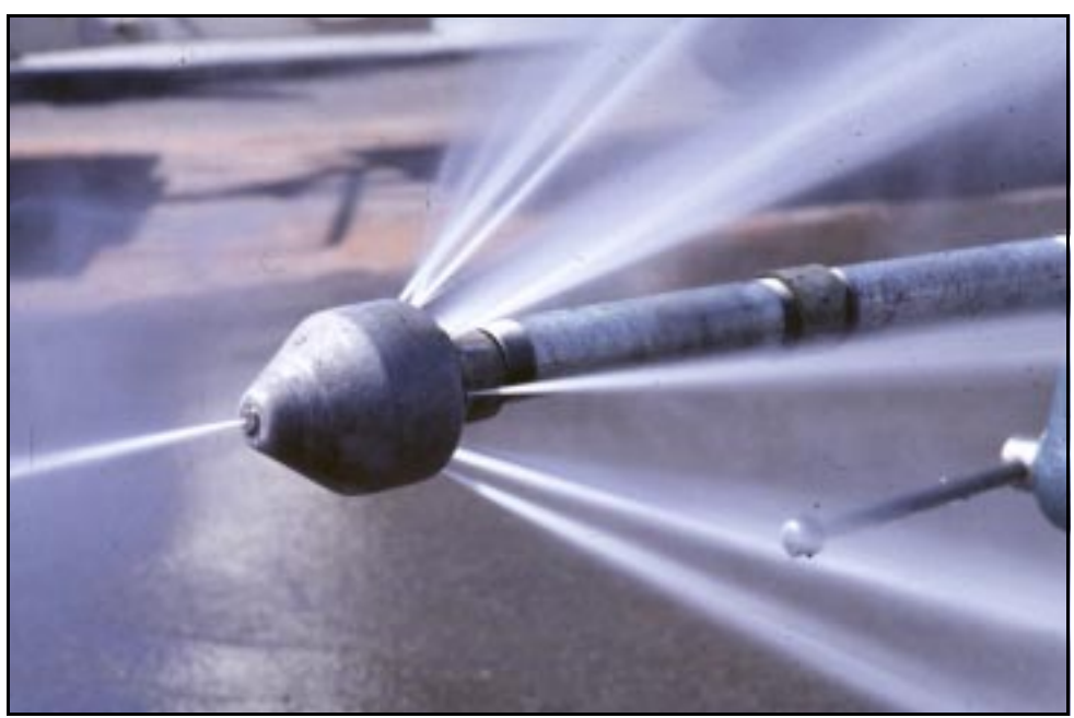
Figure 14.—High-pressure spray nozzle.