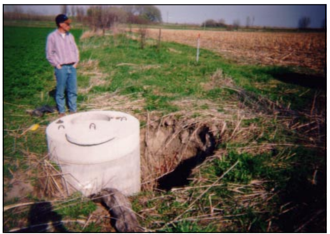
Figure 13.—Sink hole at manhole caused by improper pipe connection.

or sink holes that may develop along the drain line or around manholes as shown in figure 13. Fortunately, the manholes are most accessible during the nonirrigation season when personnel typically have the most time to do the monitoring.