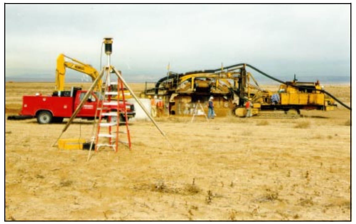
Figure 12.—Laser plane system.