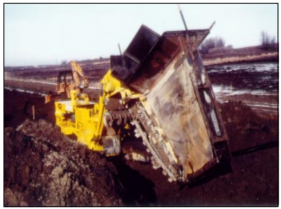
Figure 9.—Chain trencher.