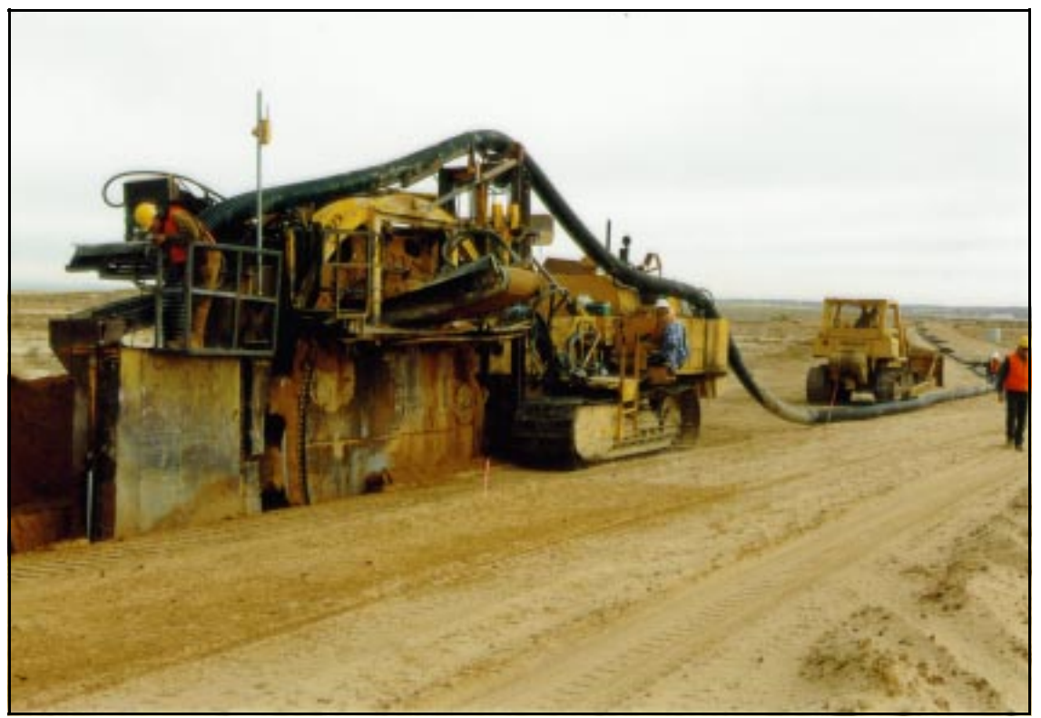
Figure 7.—Wheel trencher.