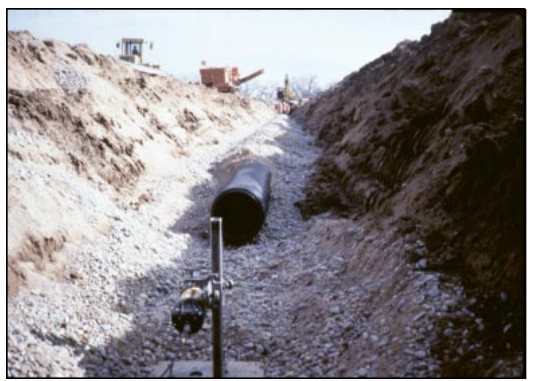
Figure 2.—Pipe being covered with granular envelope material.

Reclamation specifies granular envelopes (figure 2) for all pipe drains because properly designed granular envelopes satisfy all four of the functions. This synthetic filters (figure 3), while less costly initially, satisfy only the first of the four functions. The drain may fail due to clogging of the filter, water bypassing the drain rather than entering the pipe, or crushing of