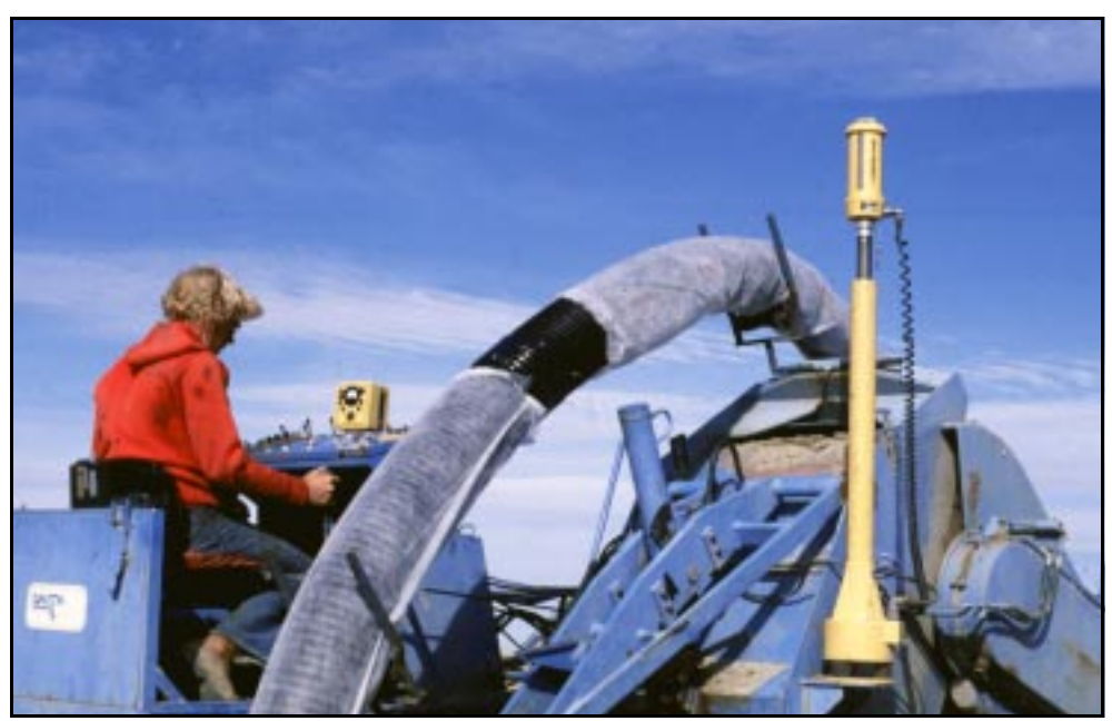
Figure 3.—Pipe with thin filter sock.

the pipe due to improper bedding. If the drain fails, it is more costly in the long run. Once installed and operating, granular envelopes have a life expectancy in excess of 50 years. Drains with a granular envelope constructed on the Huntley Project near Billings, Montana, have operated for nearly 90 years with no indication of envelope deterioration. Design criteria for granular envelopes can be found in Reclamation's Drainage Manual (1993). Figure 4 shows typical gradations for four soil types and an "A" Zone which fits all four cases. R.J. Winger, Jr. published "A Simple Method for Selecting Gravel Envelope for Agricultural Pipe Drains" in Bulletin No. 88.