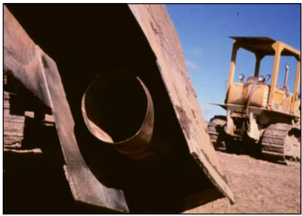
Figure 10.—Trencher boot arrangement.