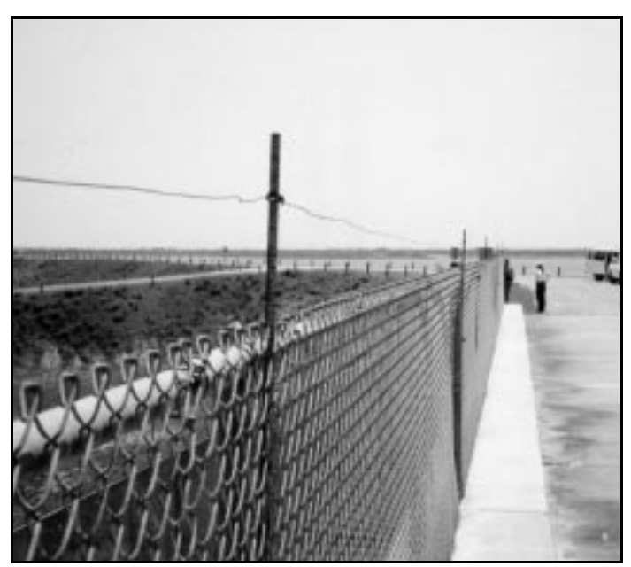
Figure 1.—Wire barrier above fencing at Choke Canyon Dam.

It is not unusual to see buzzards circling overhead during a site visit at a large dam. At Choke Canyon Dam, these large birds used to relax atop the fences and handrails surrounding the hoist deck for the spillway to gain an easy view of carrion in the landscape below. Reservoir