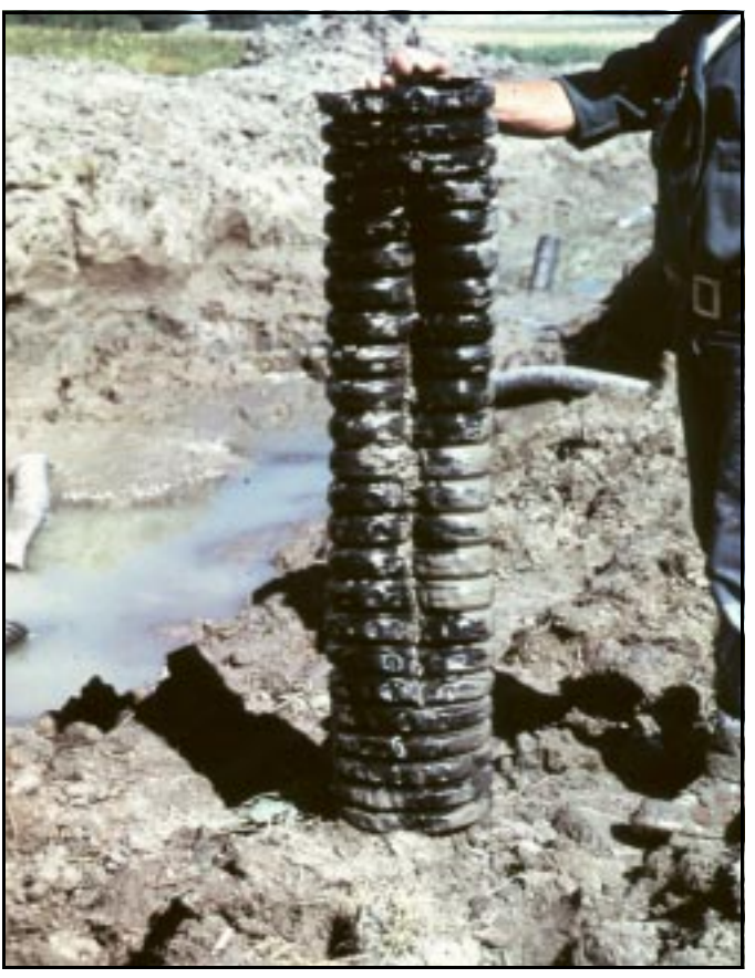
Figure 1.—Pipe failed due to stretch.

HDPE is flexible pipe and, as such, derives much of its load bearing strength from the soil or envelope material surrounding the pipe. It is important to consider this aspect during both the design and construction of HDPE drain lines. With most construction techniques, corrugated HDPE is subject to stretch during installation. A small percentage of stretch is acceptable, but anything above 5 percent is unacceptable because the pipe begins to lose strength, and, at 10 percent stretch, structural failure is probable. Figure 1 shows the shape that the pipe takes as a result of stretch failure. The crease is typically on the bottom of the pipe, and the pipe does not appear to have failed if one uncovers and examines the top of the pipe in place. Reclamation has developed Standard Specifications No. M-20 for Corrugated Polyethylene and Polyvinyl-Chloride Drainage Pipe. The standards are based on American Society for Testing and Materials