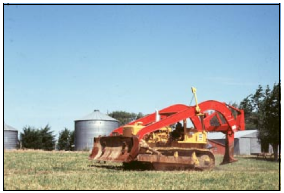
Figure 11.—Drain plow.