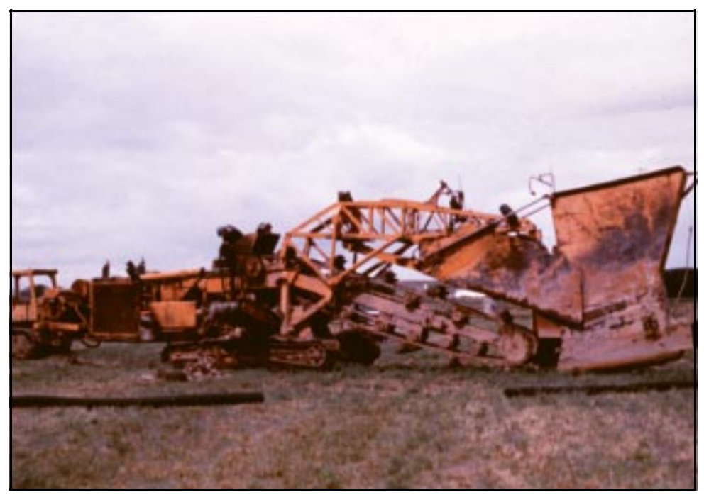
Figure 8.—Ladder trencher.