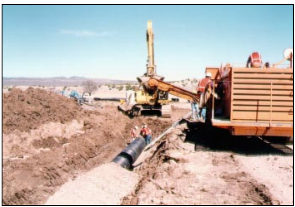
Figure 5.—Open trench without box, gravel uncontrolled.

Drains are often constructed by excavating a trench with a backhoe, laying the pipe and envelope in the bottom, and backfilling. This process is referred to as "open trench" construction. Reclamation highly recommends use of a trench box for open trench construction. Besides safety considerations, better control of the envelope material within a box generally results in a better end product (figures 5 and 6). Dewatering is not required but is generally recommended if the water table is more than a few inches above the bottom of the trench.