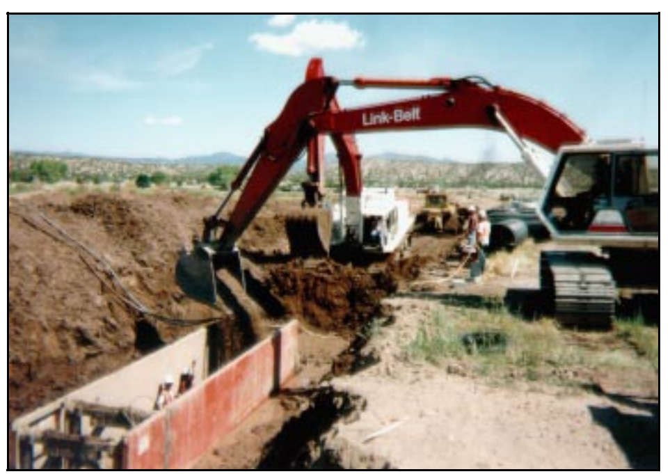
Figure 6.—Open trench with box, envelope material controlled.