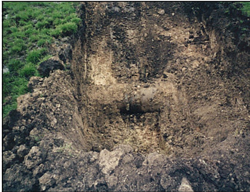
Damaged area exposed before bank sides have been laid back.

After exposing the line, it was found that a rock in the original backfill had fractured the cement mortar outer coating directly adjacent to a joint in the pipe; moisture caused the joint to rust from the outside, causing it to fail.