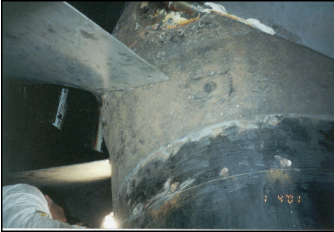
El Vado runner hub after removing loose material.

This is the first time the coating has been used in this particular application, and it will not be known how well the coating held up until the next unit inspection ( note : a followup article will be printed regarding the durability of the repair method). Mr. Kennedy (505) 662-8216, or Bob Major in the Albuquerque Area Office (505) 248-5368, can supply more details about the repair longevity and procedures.