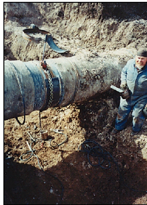
Repair sections clamped in place before welding.

The pipe was pre-stressed with a wire wrapped around it. Once the outside mortar set, the pre-stressed wire was rewound around the pipe and the two ends pulled tight together. The ends were held in place with vice grips while lap welding. The repair was now complete.