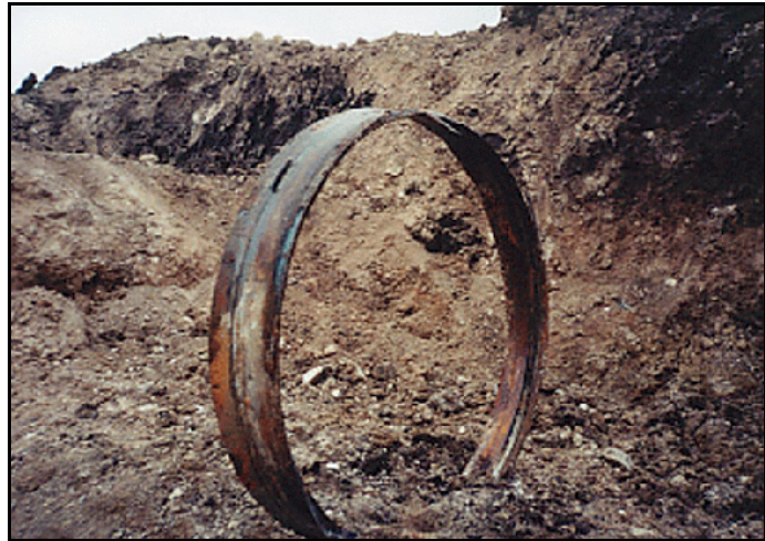
A cut out damaged joint.

To complete this repair, the joint had to be cut out and a section welded into the pipe. To accomplish this, the cement mortar outer covering had to be removed back to a point that allowed room to work. Air impact chisels worked well for this procedure. The next step was to expose solid pipe that could be welded to; this meant cutting out an approximate 1-foot section of the pipe. A local tank manufacturer rolled a 15-inch section of 1/8-inch plate to the outside diameter of the pipe. The ring was then cut into two sections to allow the district to install it on the pipe. The half sections were placed on the pipe and held in place with a come-a-long to reduce warping while being welded. A chain was placed around the pipe, and a port-a-power was used to put pressure directly on the area being welded. Shorter sections were then welded and alternated from side to side to keep warping to a minimum. The welding was done with a portable wire feed.