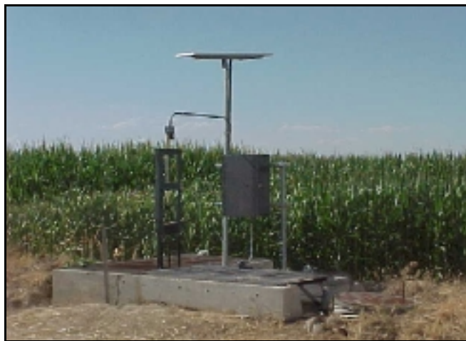
Figure 5.—The complete AFT unit. The gate diverts water to the right over a Cipolletti Weir. The water then runs down the vertical culvert into a piping system.

The AFT has been installed on three farm turnouts near Boise, Idaho (figure 5). Testing of these sites was conducted throughout the latter half of the 2000 irrigation season. An additional AFT was installed in Yuma, Arizona, in the spring of 2001. So far, all system components have functioned properly in the intense summer heat as well as the humidity and dust. The AFTs were left in the field during the nonirrigation season to see how well they endure the winter months. Plans are underway to install this device on other farm turnouts to determine its ability to operate in a variety of canal environments. All of the farmers involved appear to be comfortable with the technology and are capable of maintaining most of the components in the system. It also appears to be beneficial to have the farmers participate with the installation so that they are familiar with the system and how it works.