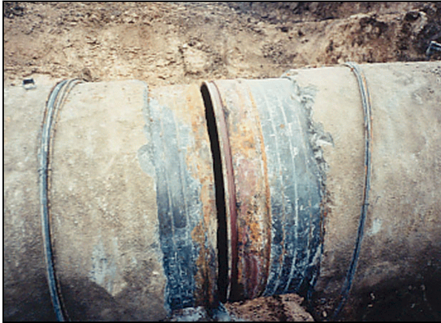
Damaged joint exposed.