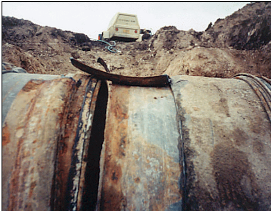
Damaged joint showing rusted area.