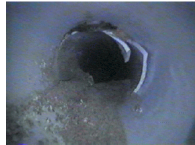
Washakie Dam; 8-inch-diameter PVC.

In February 2001, the FPST sent out a questionnaire to Reclamation's Technical Service Center (TSC) Principal Designers and Regional Dam Safety Coordinators to gather information on where flexible pipes have been used. The results are currently being compiled, and additional information will be collected as the study progresses. Periodic updates will also be provided.