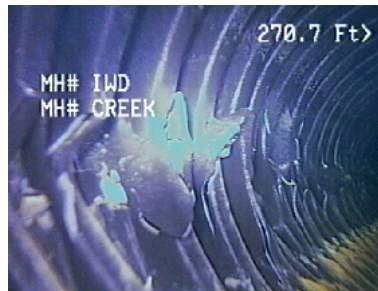
San Justo Dam; 18-inch-diameter HDPE.