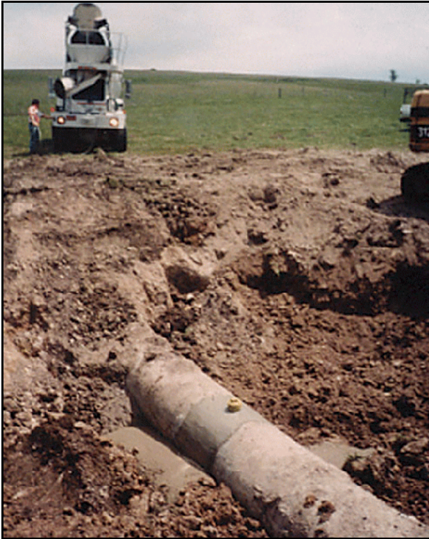
Completed repair before final backfilling. Notice the access plug at the 12 o'clock position to facilitate interior pipe coating. Two other plugs are located at the 8 and 4 o'clock positions.

To accomplish the backfill, the excavation was closed and compacted to within about 2 feet of the repair. The area adjacent to the pipe was left open. The area under the pipe was left undisturbed. A 1.5 sack slurry mix was poured into the open area around the pipe and up the sides to the top one-third of the pipe. This was left open for 24 hours. The line was then charged.