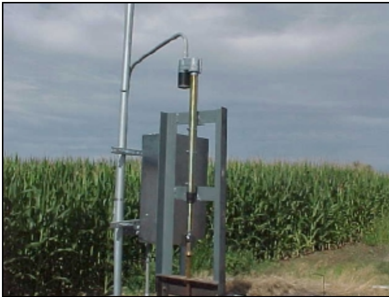
Figure 3.—The linear actuator that is used to move the turnout gate. This turnout uses a waterman gate.

The actuator is a mass-produced product that was originally designed to move satellite dishes (figure 3). It is relatively inexpensive, readily available, and has limit switches and a position sensor mounted internally. This reduces the cost of the AFT because fabrication costs are reduced and additional components are not required. This actuator has a maximum operating