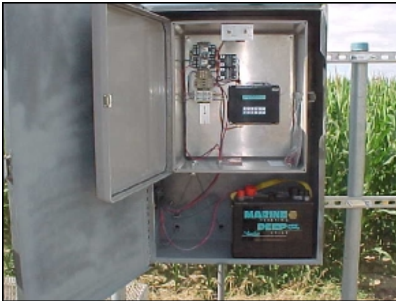
Figure 1.—Control box showing CPU, interface electronics, and battery.

The AFT consists of three primary components as well as peripheral measurement devices. These components include a linear actuator, a turnout gate, and a low-cost controller (i.e., central processing unit or CPU). Several CPU devices were considered for this application, with costs ranging from $100 to $2,000. The lower-cost CPUs require additional