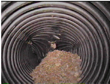
Davis Creek Dam; 12-inch-diameter HDPE.

For the last 15 to 20 years, the Bureau of Reclamation (Reclamation) has been using flexible plastic pipe (mostly HDPE and some PVC) for toe drains and finger drains in earth-fill dams. The Flexible Pipe Study Team (FPST) was formed in January 2001 to assess the possible causes and solutions for recently detected drain failures at a few dam installations (see below). These failures were detected during remotely controlled video inspection.