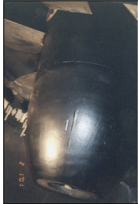
El Vado runner hub after coating with pick-up bedliner.