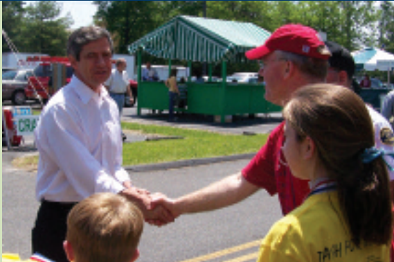
Congressman Sestak talking with constituents at the Chester County Hospital May Fair about health care issues.

“It was once said that the moral test of government is how that government treats those who are in the dawn of life, the children; those who are in the twilight of life, the elderly; and those who are in the shadows of life, the sick, the needy and the handicapped.”