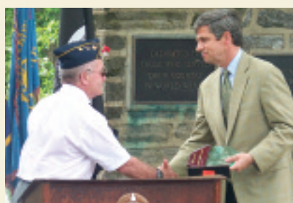
Congressman Sestak speaking about veterans' issues at the Glenolden Memorial Day Service.

Fought to ensure our active and retired military men and women are getting the medical attention they need: