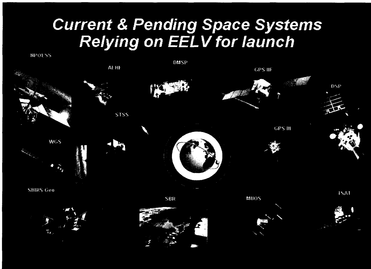
Figure 1 – Space systems relying on EELV

In today's era of rapid response to worldwide contingencies, warfighters depend on space-based capabilities across the entire spectrum of combat. Space systems satisfy critical requirements for navigation, strategic and tactical communication, intelligence, surveillance, reconnaissance, weather forecasting, environmental monitoring, missile warning and battlespace characterization. Space-based remote sensing satellites identify and locate targets. Weather satellites provide input into mission planning and weapon system selection. Satellite communication systems are used for command, control, and communication throughout the mission. Remote sensing satellites are also used for post-mission battle damage assessment and re-attack planning. The entire warfighting effort takes place under the protective umbrella of timely and accurate spaced-based missile warning reporting for land and sea based missile defense. All of these satellite systems, providing the support today's warfighter needs, require EELV to reach orbit (Figure 1).