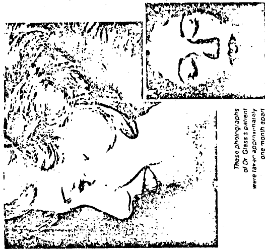
These photographs of Dr. Glass's patient were taken approximately one month apart.