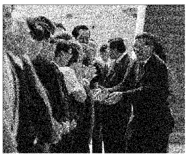
Hun Sen greeting senior officials