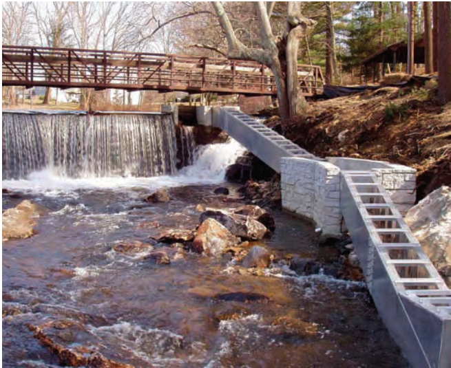
Fish Ladder at Jordan Mill Pond, Waterford, Connecticut, created using settlement funds from the RTC 380 oil spill.

other visitors to the site can learn about the history of the dam and mill and the life cycle of river herring. Seeing springtime herring runs is an event that most people never forget.