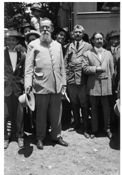
Venustiano Carranza, the leader of the Constitutionalists.

Although Wilson did not trust reporting from businessmen with interests in Mexico because of their biases, he did