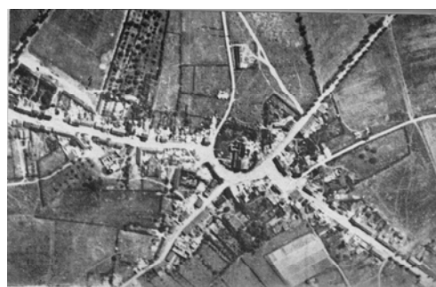
Passchendaele, 16th of June 1917

Terrence Finnegan's Shooting the Front is a massive, expertly written and richly illustrated history of British, French and American aerial surveillance on the Western Front. The book's findings are based on meticulous archival research, especially in the National Archives in College Park, Maryland, for the American side, and London's National Archives for the British. Finnegan's prose is precise and clear, and he provides the necessary historical context to make his work accessible to expert and layman alike. The photographs of the battlefield, surveillance aircraft, and deception devices—as well as maps, line