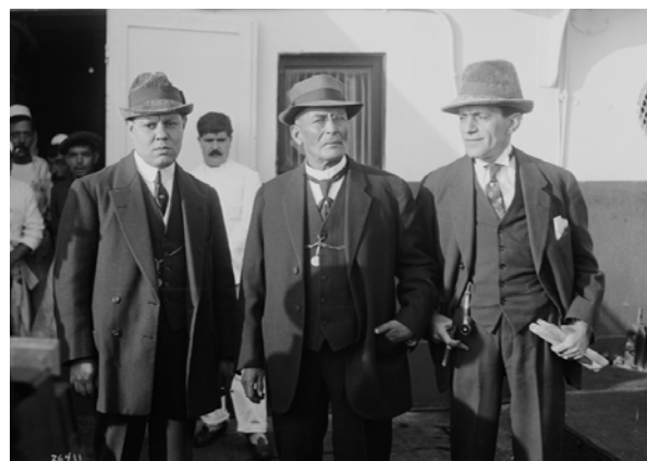
Gen. Victoriano Huerta (center) on his arrival in New York City.