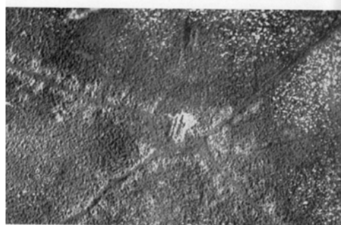
Passchendaele, 5th of December 1917