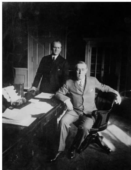
President Wilson (seated) with his private secretary, Joseph Tumulty, a key gatekeeper in passing information to the president.

regions and promoted US businesses in their area.