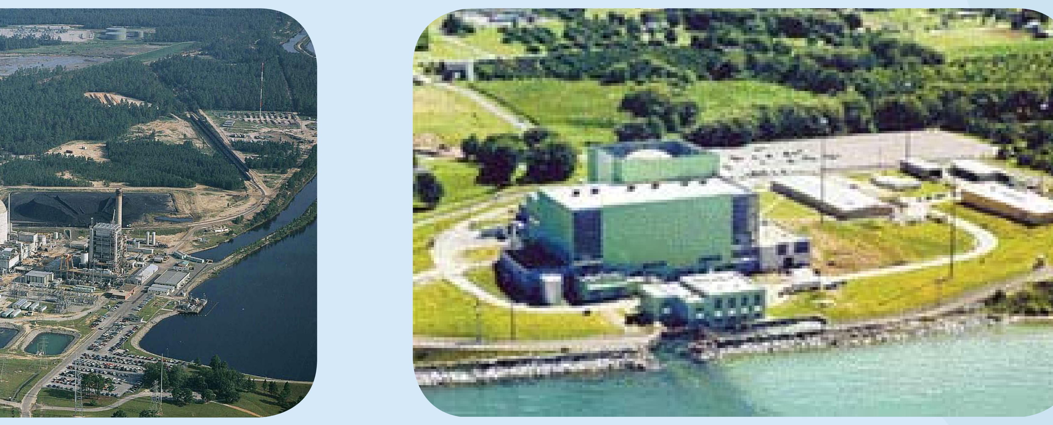
R.E. Ginna Nuclear Power Plant