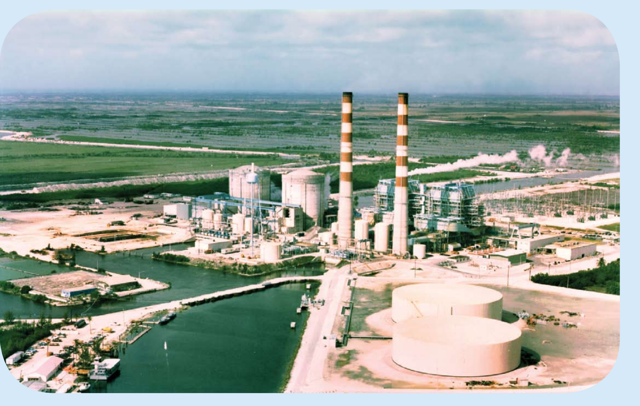
Turkey Point Plant, Units 3 & 4