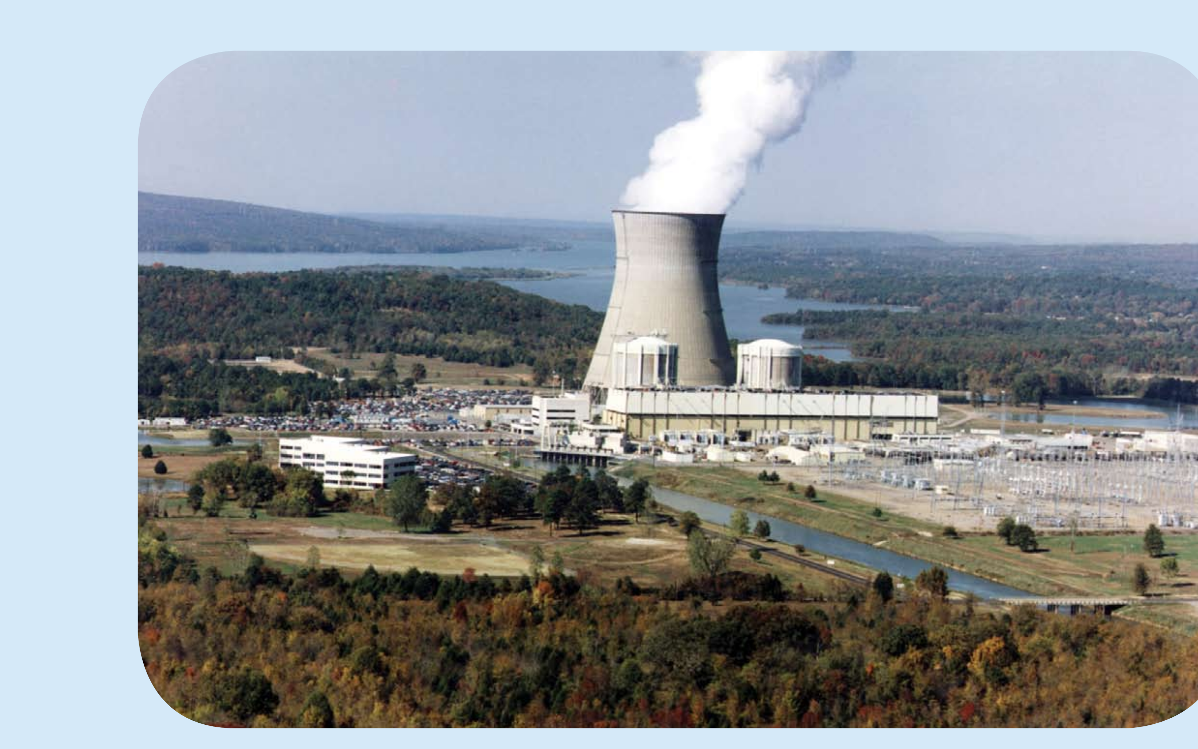
Arkansas Nuclear One, Unit 1