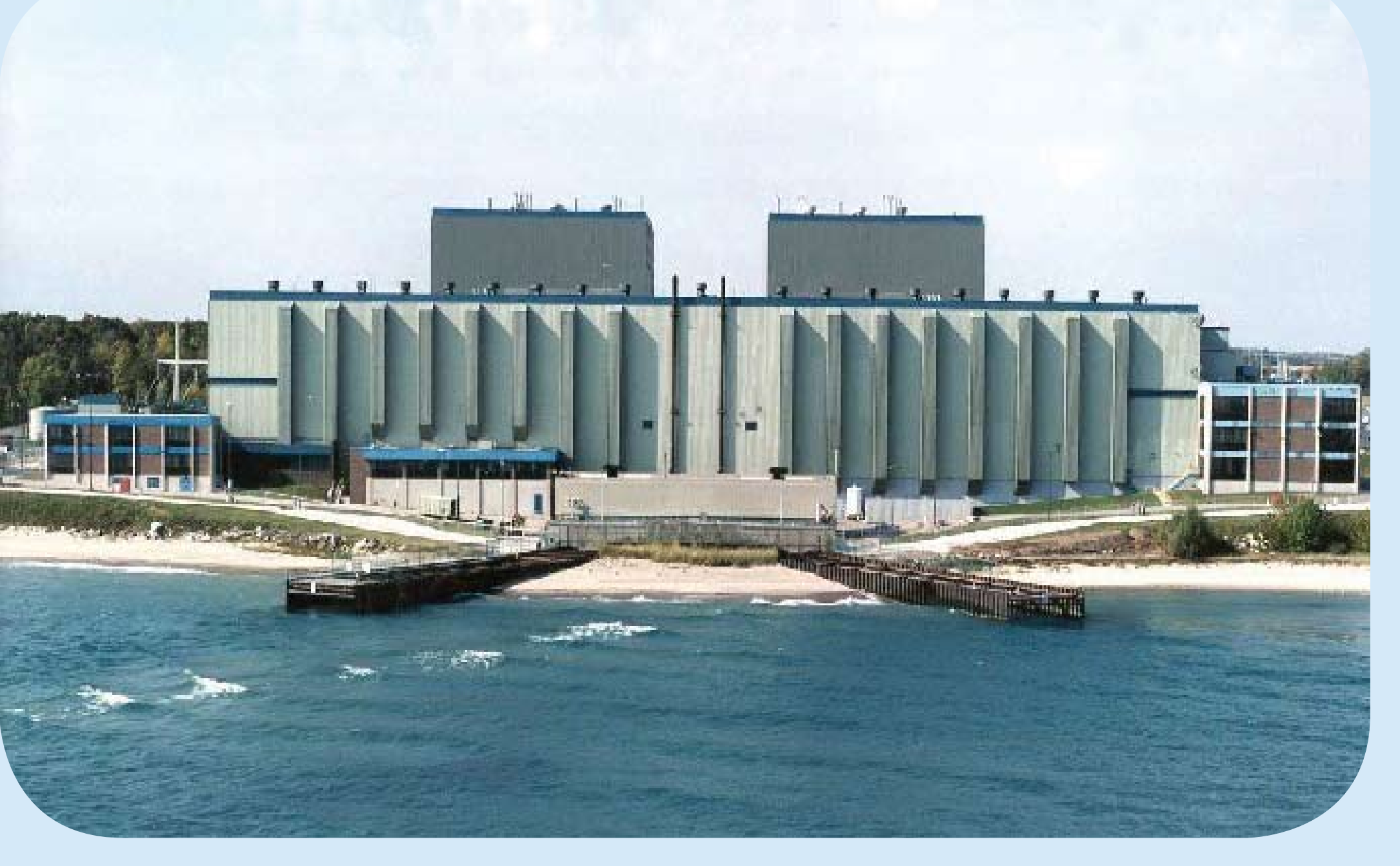
Point Beach Nuclear Plant, Units 1 & 2