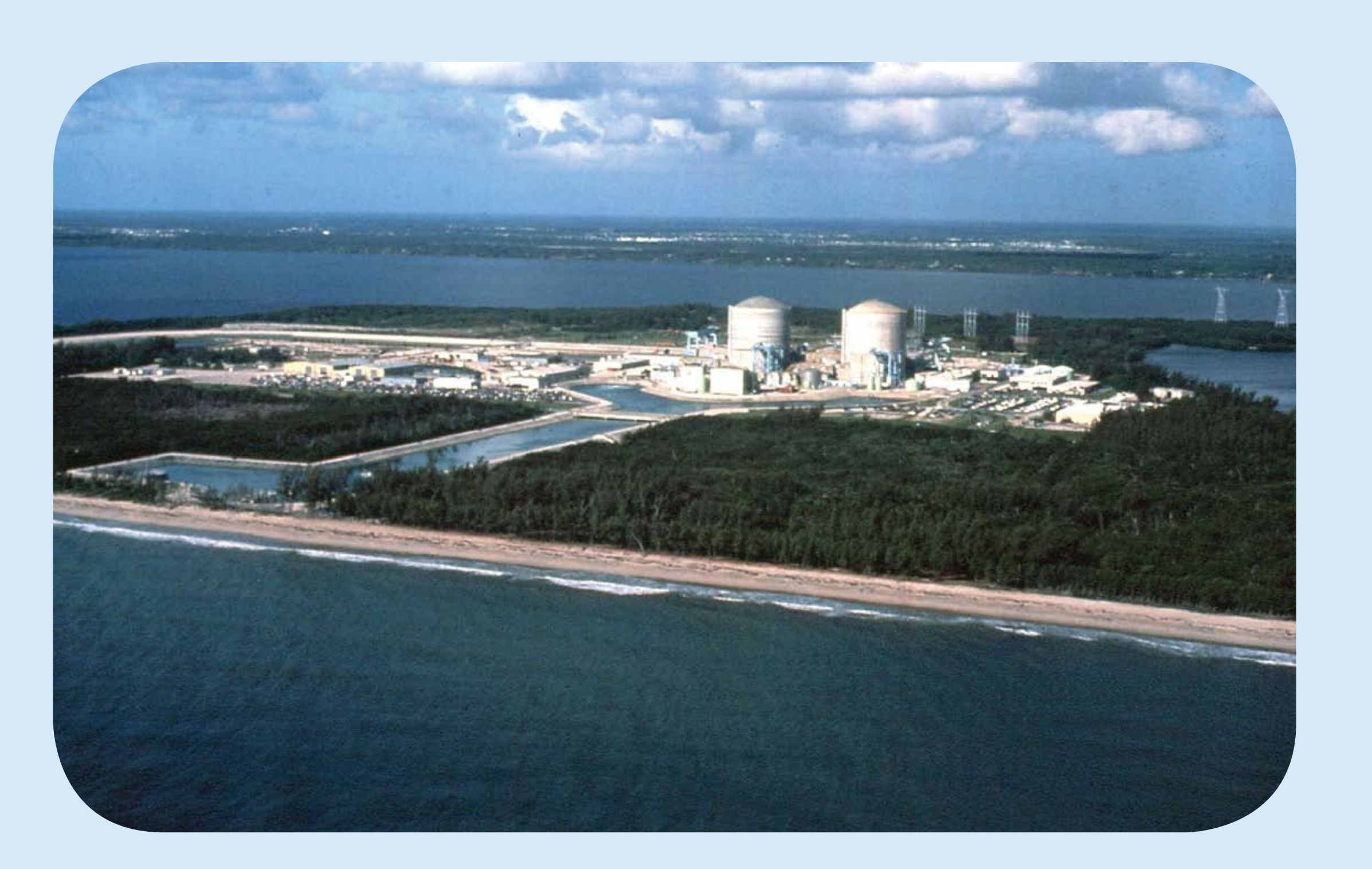
St. Lucie, Units 1 & 2