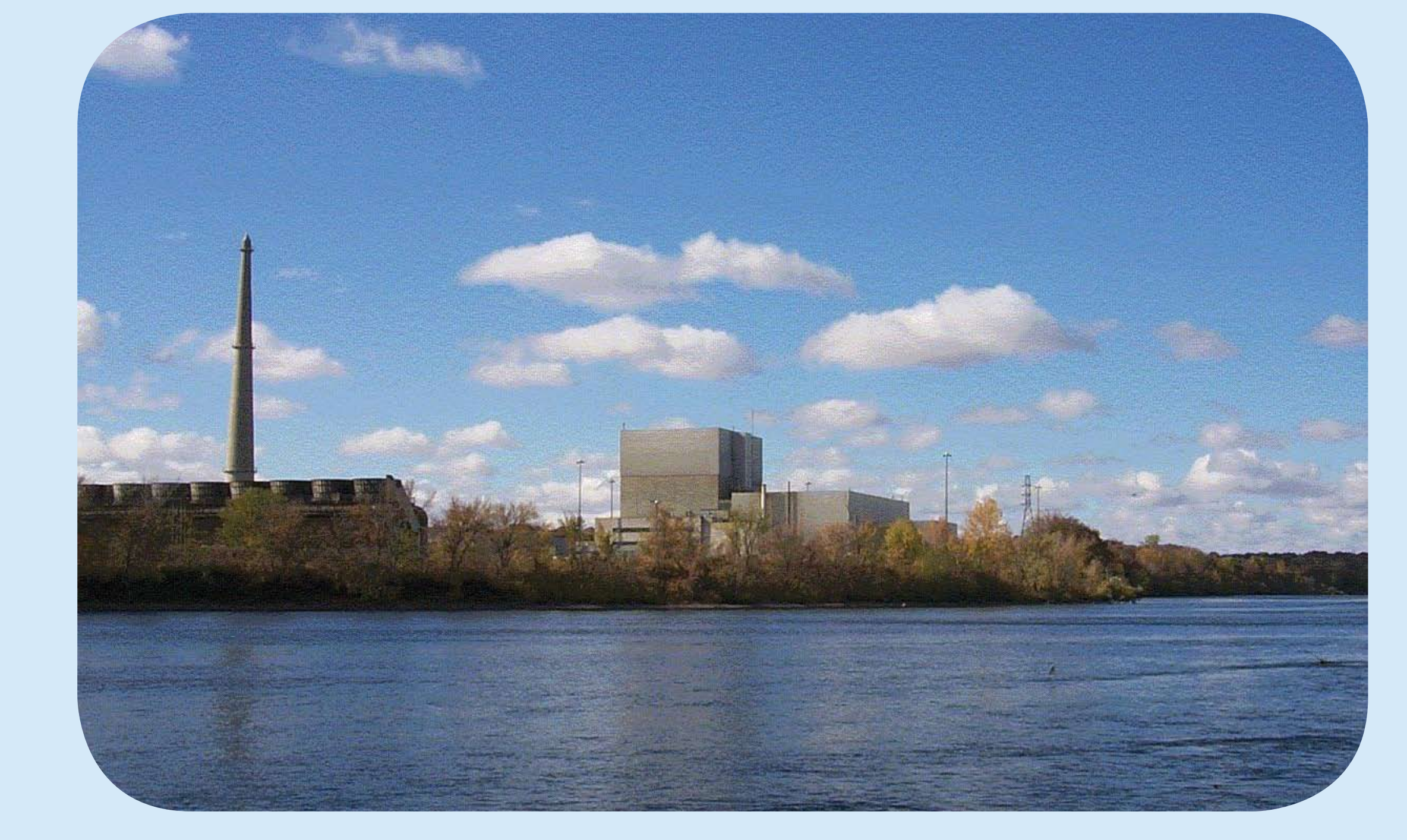
Monticello Nuclear Generating Plant