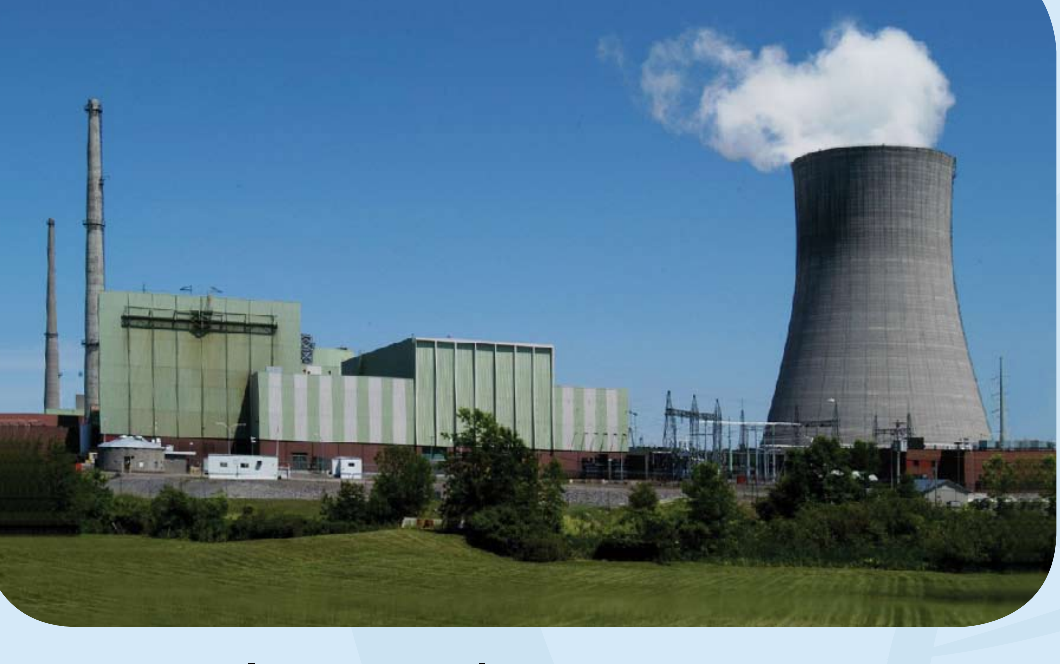
Nine Mile Point Nuclear Station, Units 1 & 2