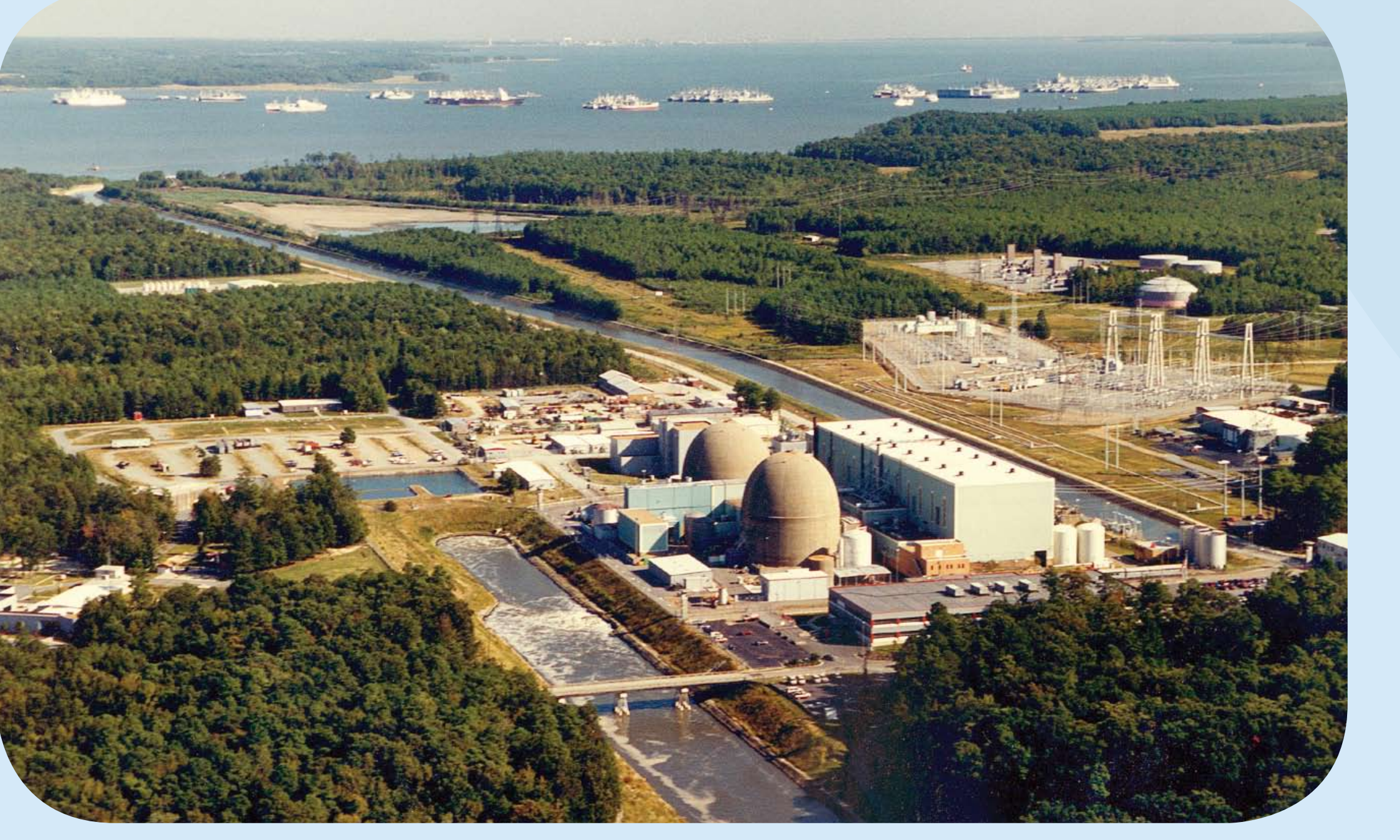
Surry Power Station, Units 1 & 2