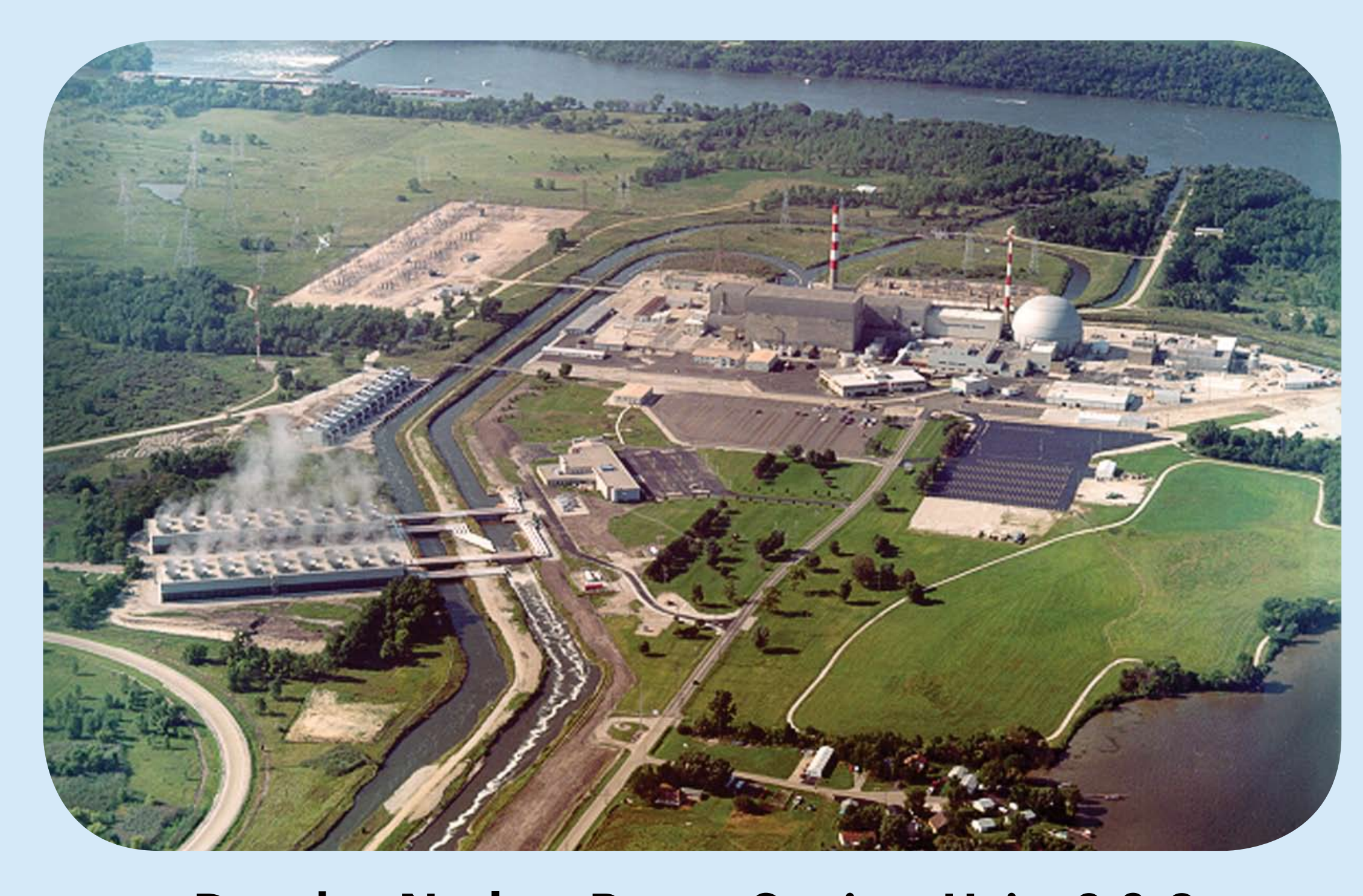
Dresden Nuclear Power Station, Units 2 & 3