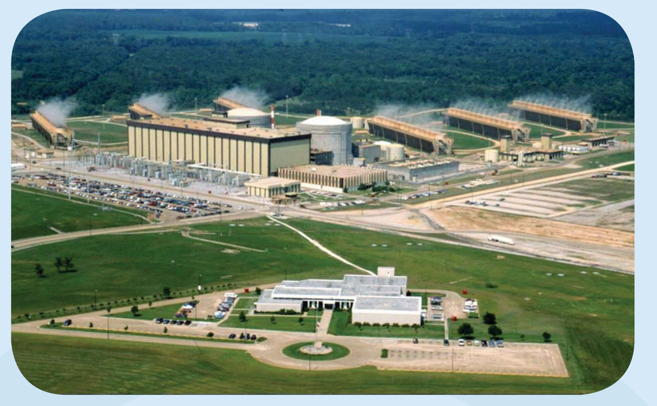
Joseph M. Farley Nuclear Plant, Units 1 & 2