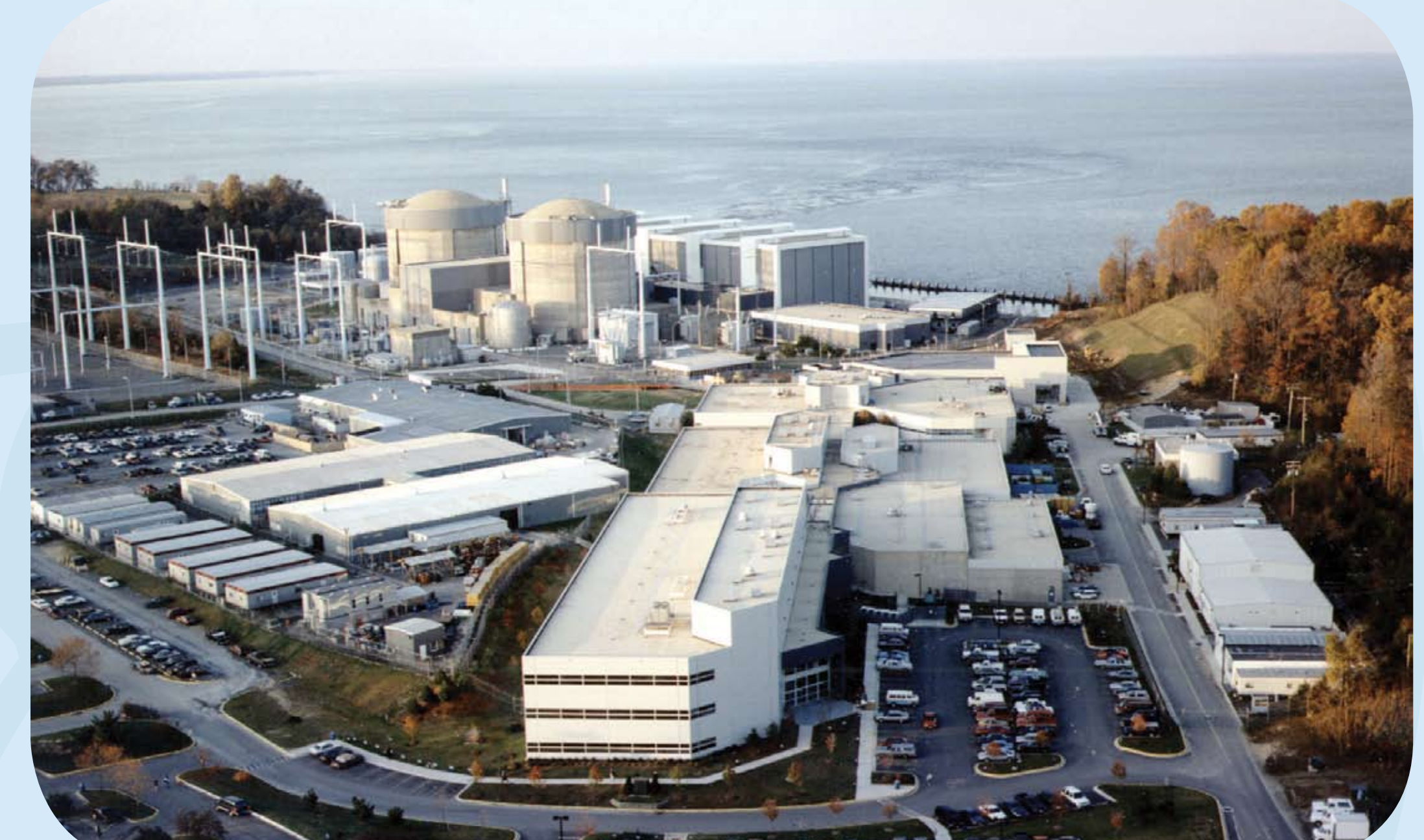
Calvert Cliffs Nuclear Power Plant, Units 1 & 2

McGuire Nuclear Power Station, Units 1 & 2