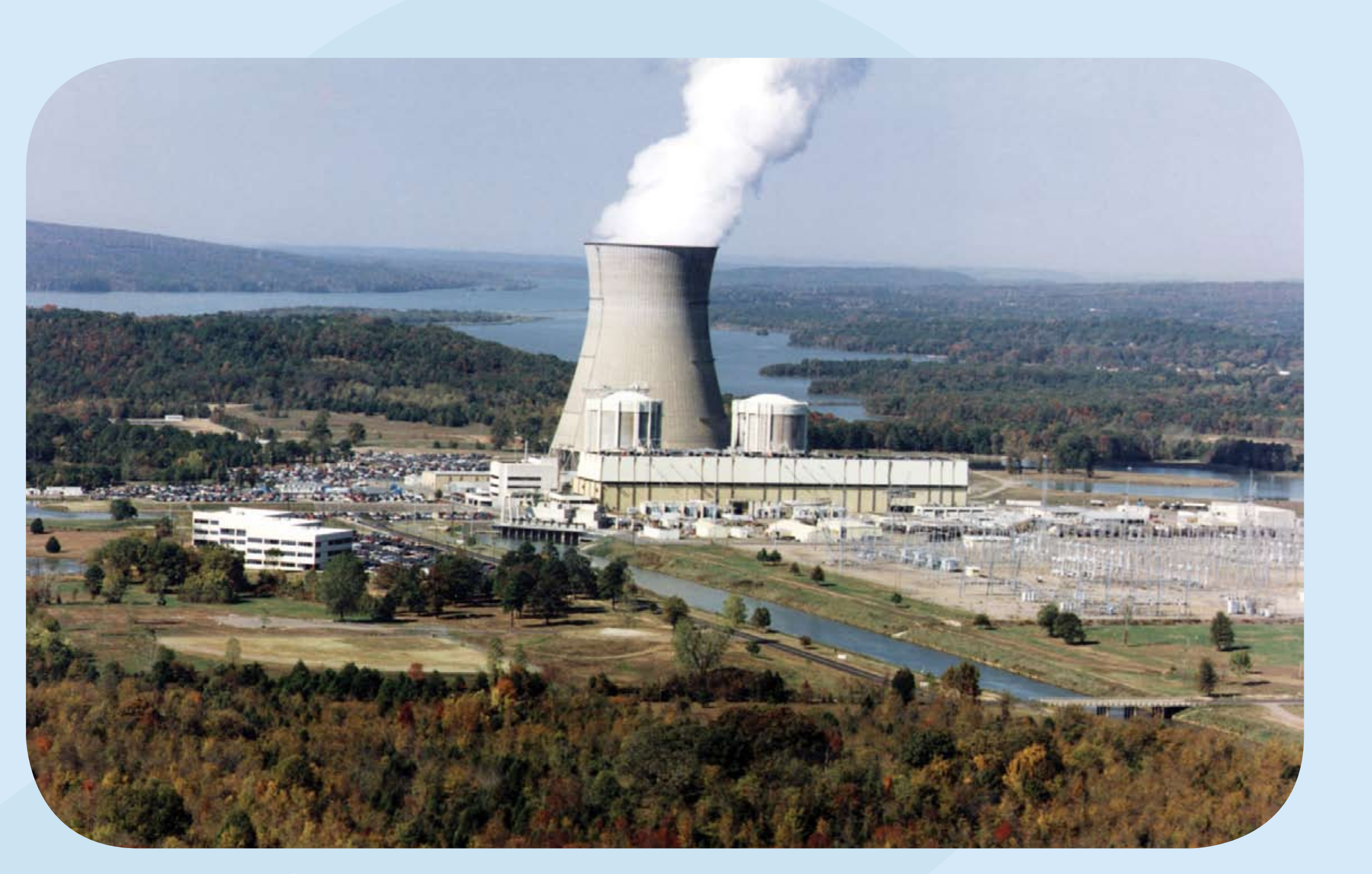
Arkansas Nuclear One, Unit 2