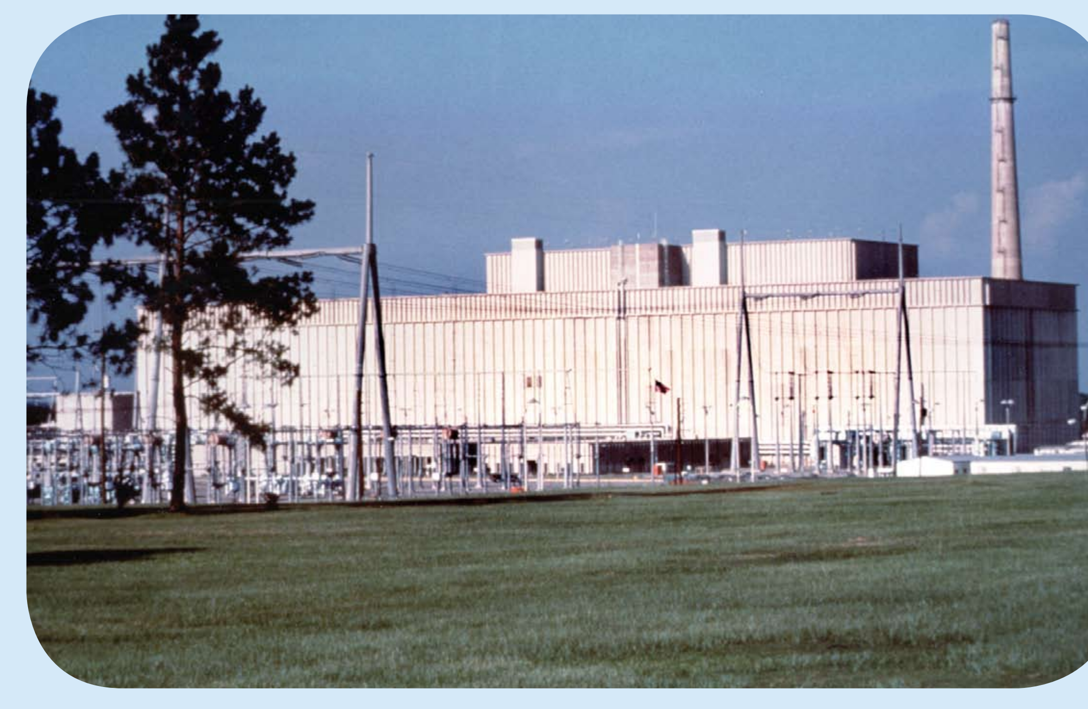
Edwin I. Hatch Nuclear Power Plant, Units 1 & 2