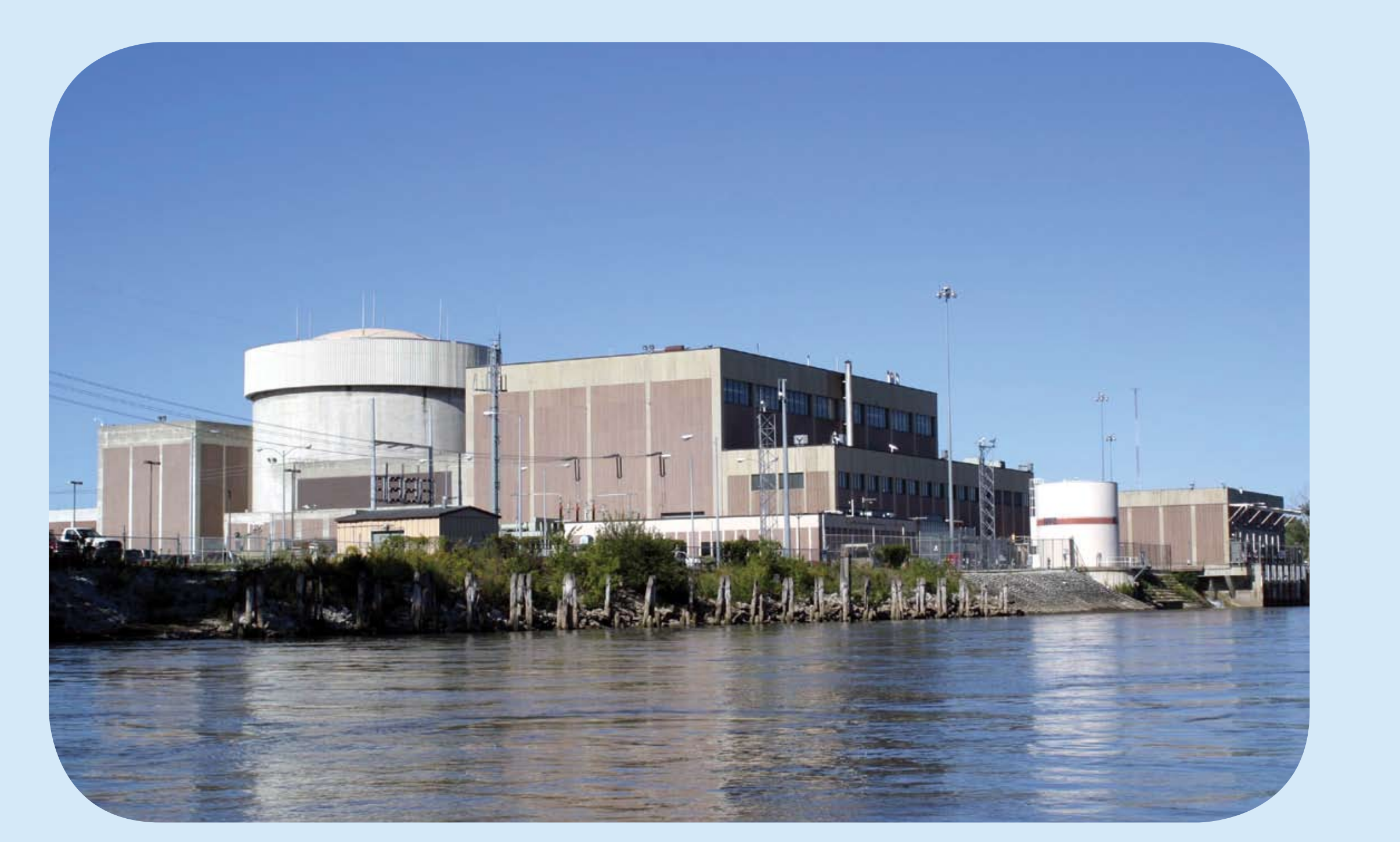
Fort Calhoun Station, Unit 1