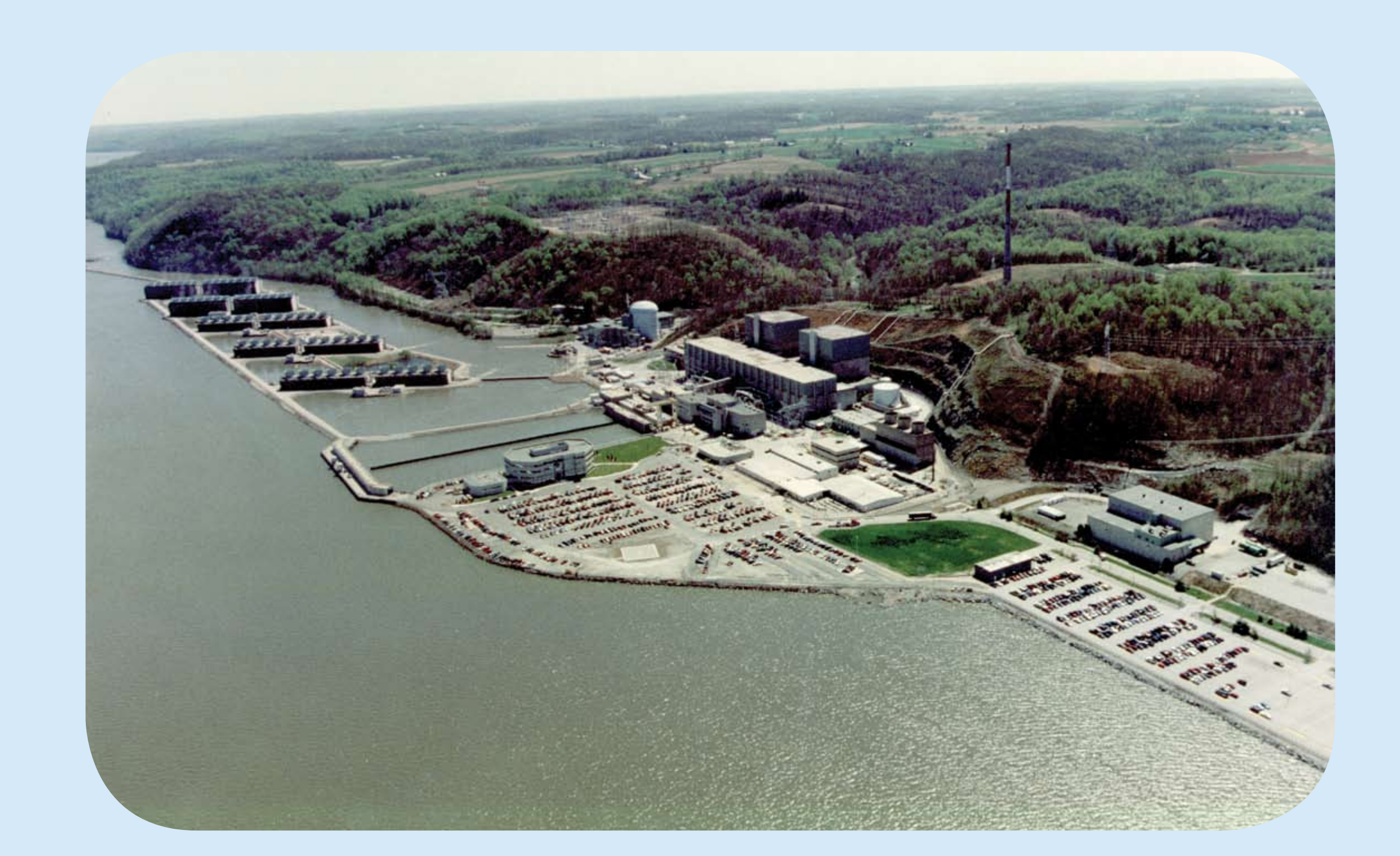
Peach Bottom Atomic Power Station, Units 2 & 3