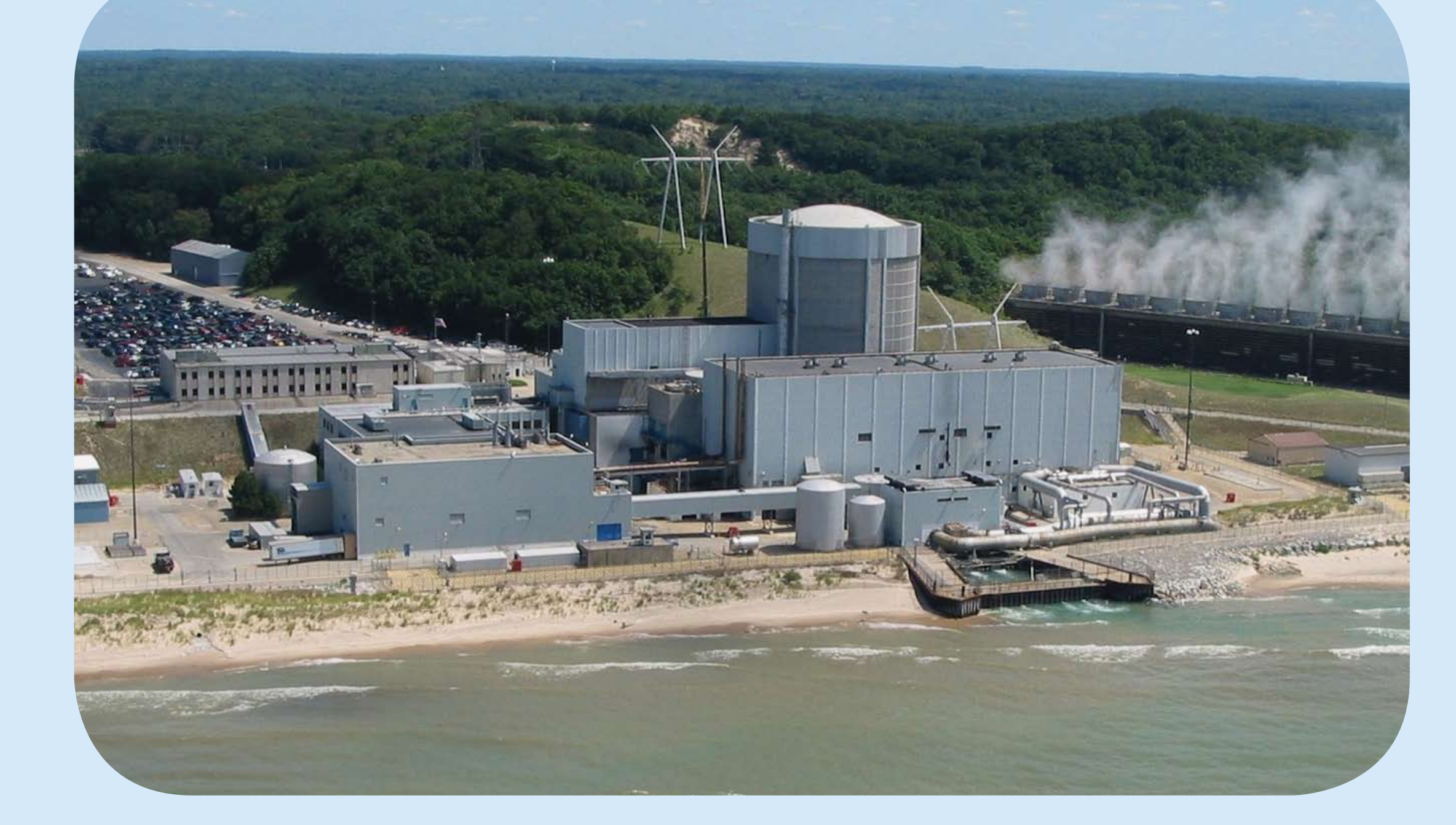
Palisades Nuclear Plant