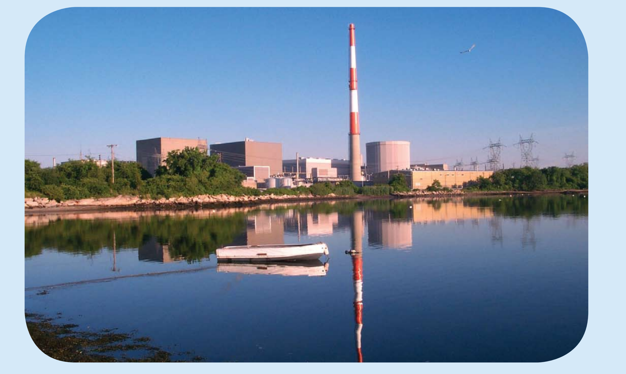
Millstone Power Station, Units 2 & 3