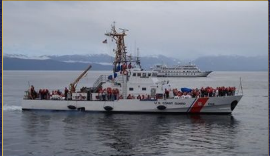
Coast Guard Cutter Liberty