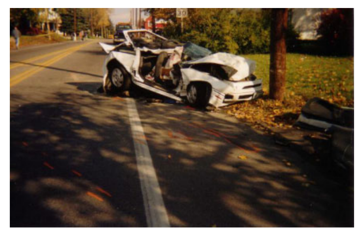
Figure 1. Pontiac Grand Prix at final rest.

of the National Driver Register<sup>12</sup> (NDR) revealed no record of suspension or revocation. Automobile insurance records, obtained via subpoena from the Chevrolet driver's automobile insurance company, showed no claims made against the policy prior to this accident.<sup>13</sup>