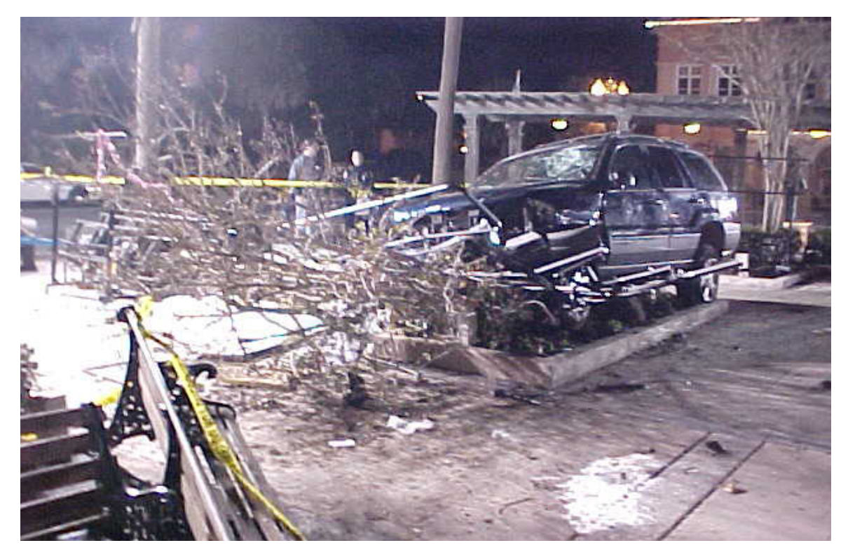
Figure 4. Jeep at final rest.

The Jeep driver told Safety Board investigators that he began having seizures in his early teens. According to his medical records, he told his physician that he had experienced about eight to nine grand mal seizures in his lifetime, and partial seizures<sup>22</sup> about once or twice a year. In January 1999, he suffered a grand mal seizure and fell down a flight of steps, resulting in head injuries that led to speaking difficulty and mild right-sided weakness. Medical records from February 1999 indicate that the physician and the Jeep driver discussed Georgia's law restricting driving for 1 year after a seizure.<sup>23</sup> Medical records from January 2002 indicated that although the Jeep driver believed that he had not been experiencing seizures, his wife reported that he had about one seizure every 2 months. The physician's records indicated that he reminded the driver about the Georgia driving restrictions.