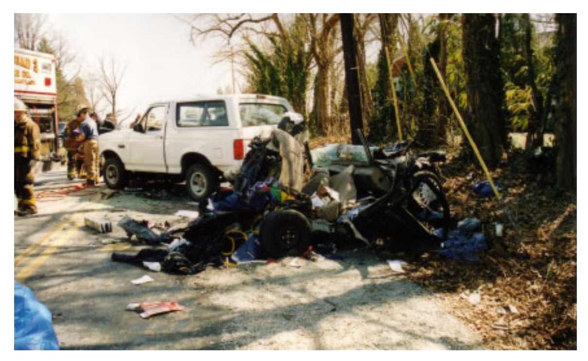
Figure 3. Hyundai at final rest.

a medical package, which instructed him to undergo an evaluation by a physician and to complete a functional capacity test.<sup>20</sup> The suspension was withdrawn on April 20, 2001, after the MAB received a report from the Oldsmobile driver's neurologist stating that the driver was physically and mentally capable of safely operating a motor vehicle. The neurologist also noted that the Oldsmobile driver had been seizure-free since the November 12, 2000, accident. No record was found to indicate that the Oldsmobile driver ever underwent a functional capacity test.