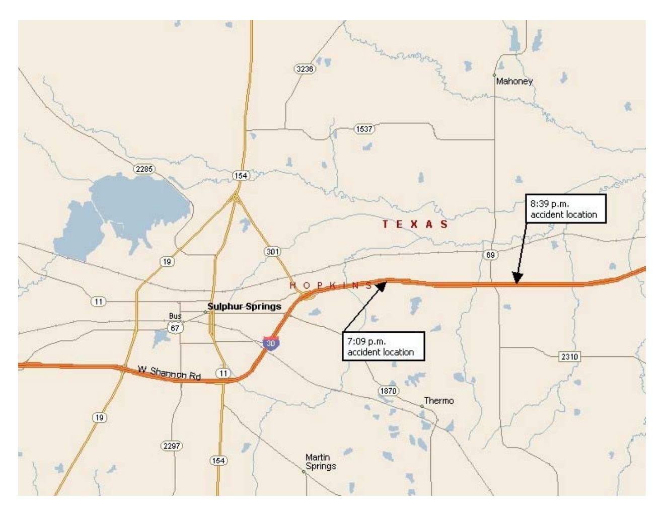
Figure 1. Locations of Sulphur Springs accidents.

The traffic queue had formed on I-30 west due to a single-vehicle crossover accident with multiple fatalities (see figure 1), which had occurred 1.5 hours earlier, at 7:09 p.m. This accident prompted the Texas Department of Public Safety (DPS) to close all eastbound and westbound lanes of I-30 and detour traffic to parallel service roads.