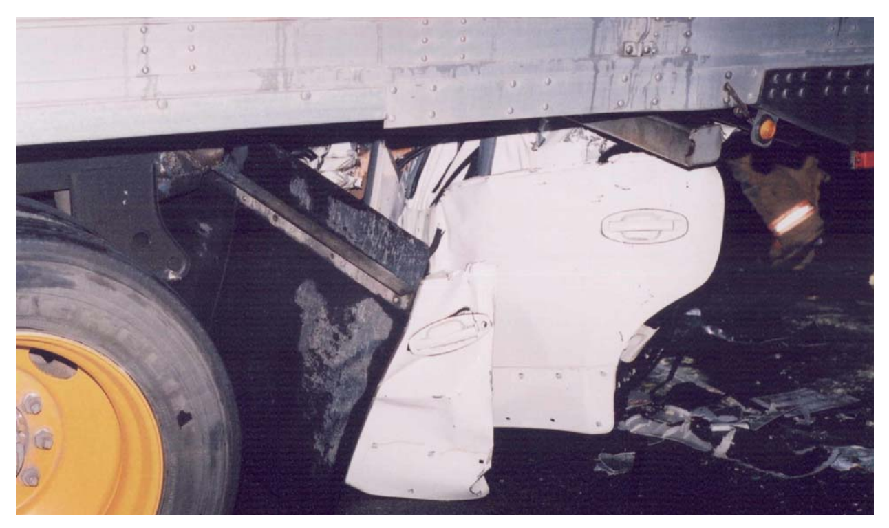
Figure 2. Hyundai lodged under Peterbilt tractor-semitrailer combination unit.

Tire marks from the 8:39 p.m. accident scene indicated that the Kenworth driver began braking approximately 190 feet before colliding with the Hyundai. Taking into account the tire marks and accident sequence, investigators estimated that the speed of the Kenworth truck was 62–70 mph prior to braking. Its speed at the time of collision was estimated at 50–60 mph,<sup>2</sup> indicating that the driver began braking approximately 2 seconds before colliding with the Hyundai. The posted speed in this area was 70 mph during daylight and 65 mph at night. An assessment of sight distance on I-30 west indicated that the driver had at least 3,000 feet of unobstructed view, or over 29 seconds at a speed of 70 mph, before reaching the traffic queue.